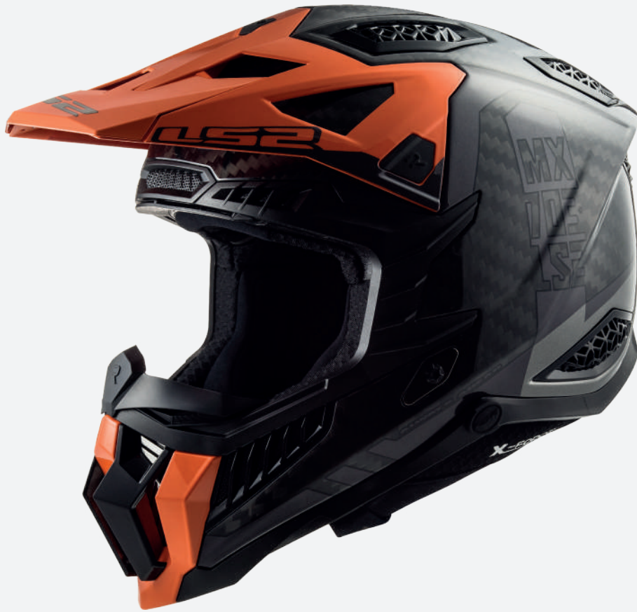
VICTORY Titanium Orange 46703 22 52