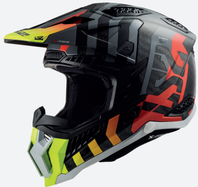
BARRIER H-V Yellow Red 46703 21 32