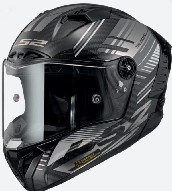
VOLT Black Blue 16805 56 23