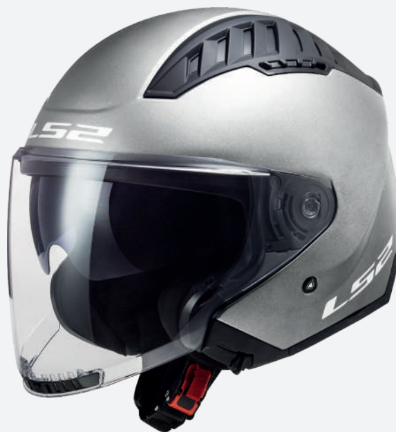
SOLID Matt Silver 30600 10 03