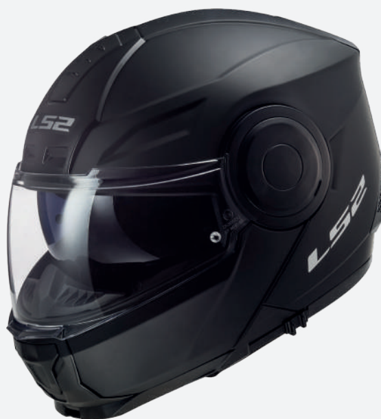
SOLID Matt Black 50902 10 11