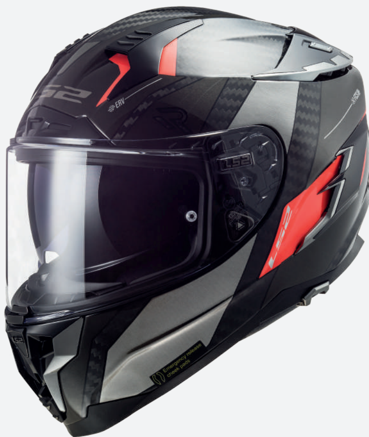
ALLOY Titanium Chrome Orange 10327 80 52