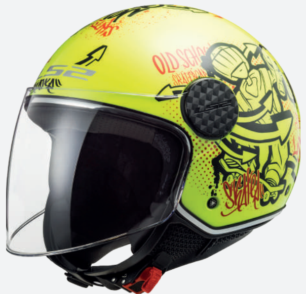
SKATER H-V Yellow 30558 71 54