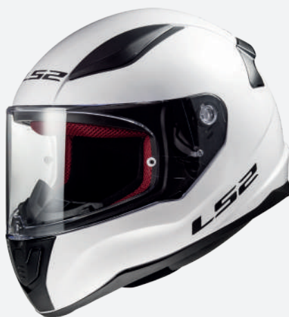
SOLID White 10353J 10 02