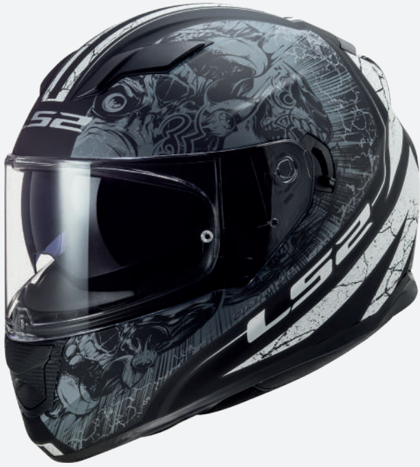
THRONE Matt Black Titanium 10320 54 07