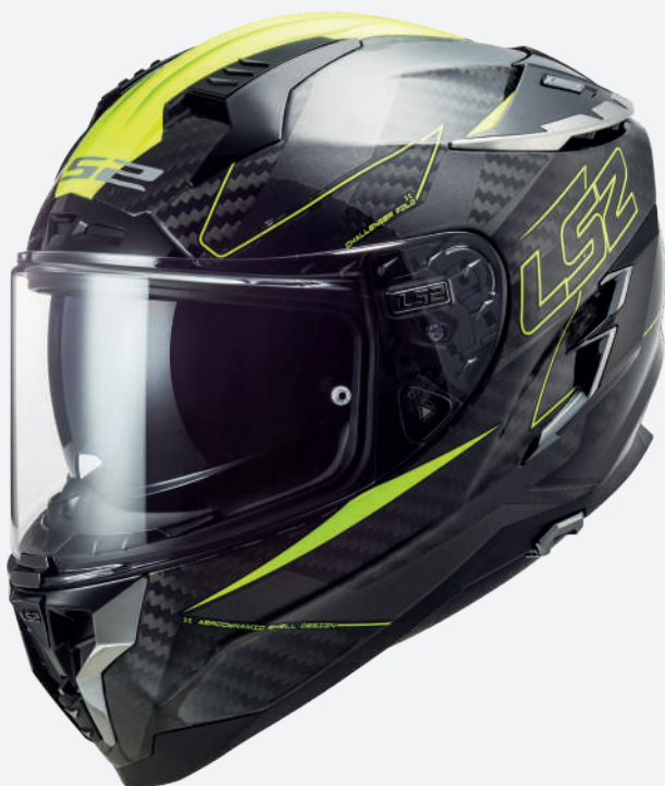
FOLD Carbon H-V Yellow 10327 76 54