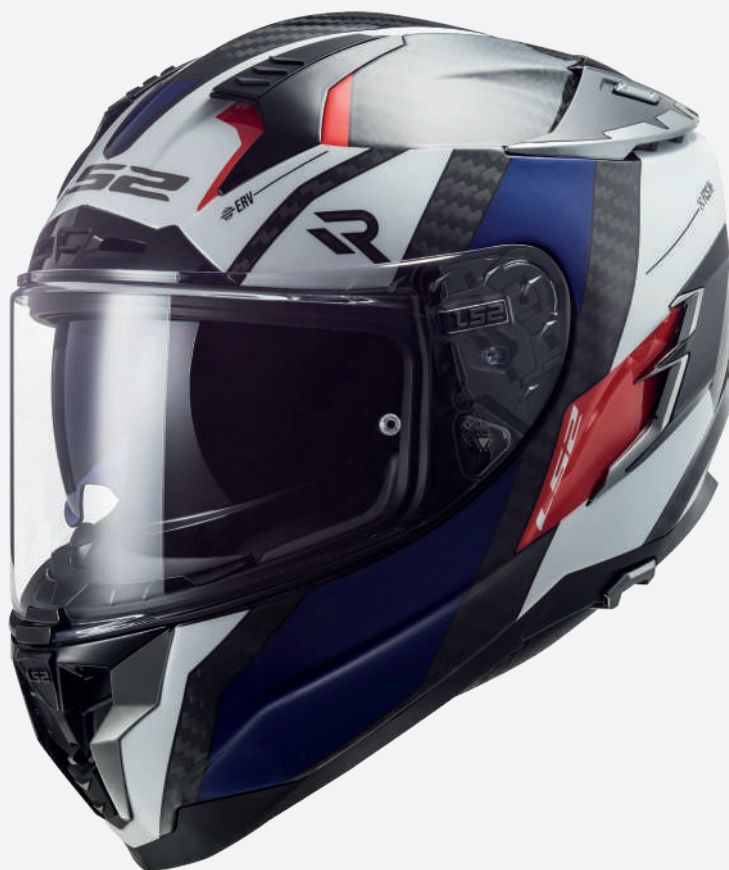
ALLOY White Blue Red 10327 80 32