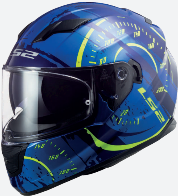
TACHO Blue H-V Yellow 10320 55 26