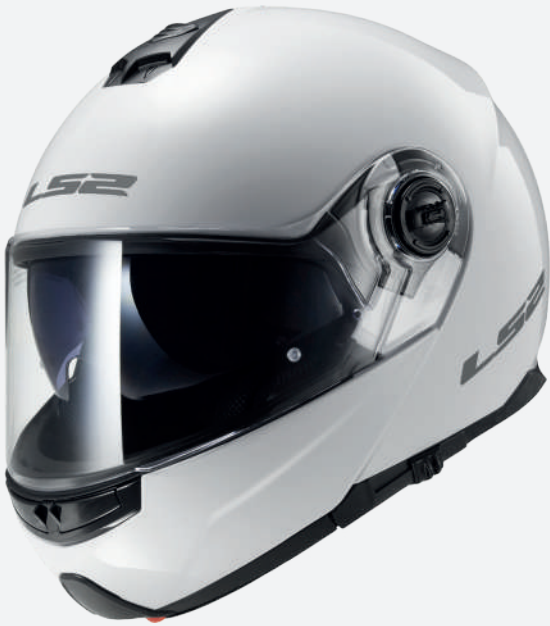
SOLID White 50325 10 02