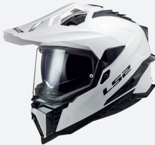
SOLID White 46701 10 02