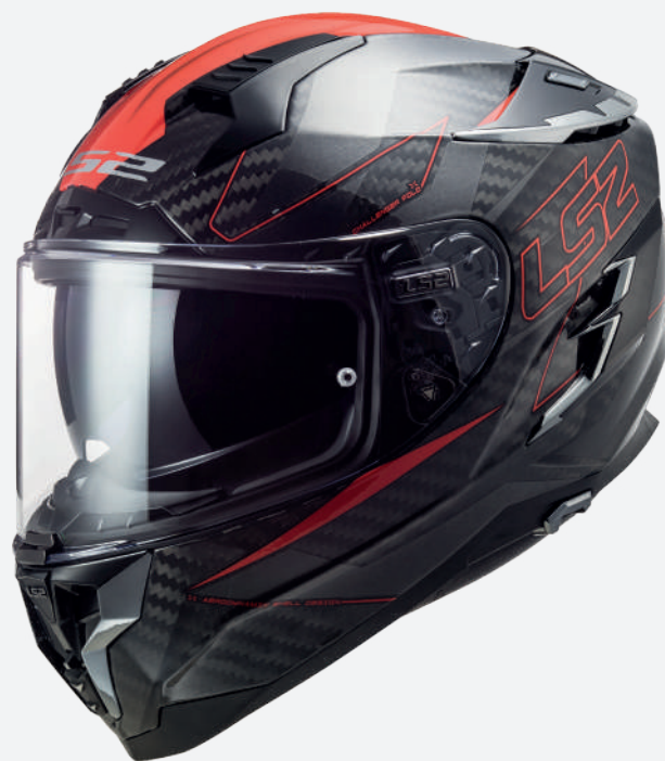
FOLD Carbon Red 10327 76 32