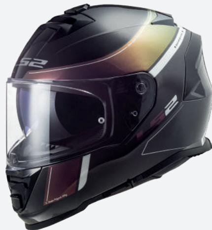
VELVET Black Rainbow 10800 30 12