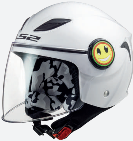
SOLID White 30602 10 02