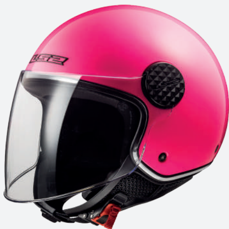
SOLID Fluo Pink 30558 50 14