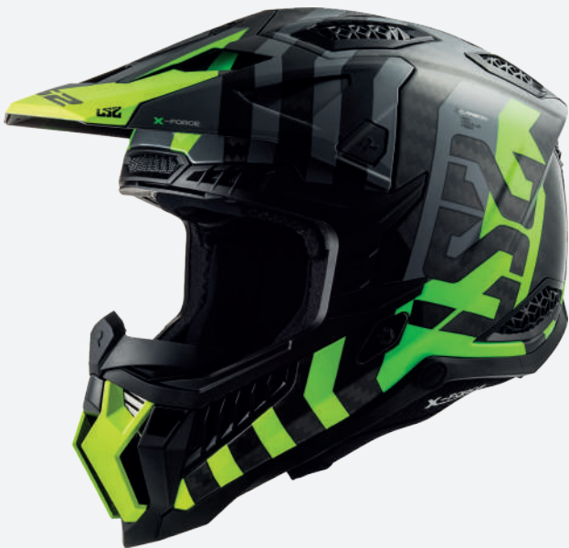
BARRIER H-V Yellow Green 46703 21 54