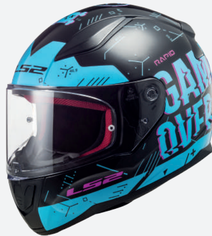
PLAYER Black Sky Blue 10353 60 12