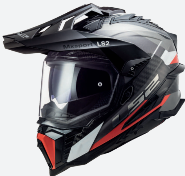
FRONTIER Titanium Red 46701 61 08