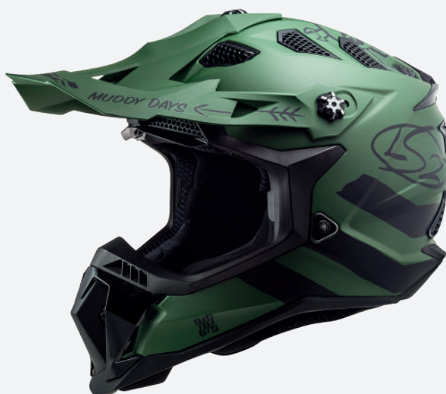
CARGO Matt Military Green 46700 23 62