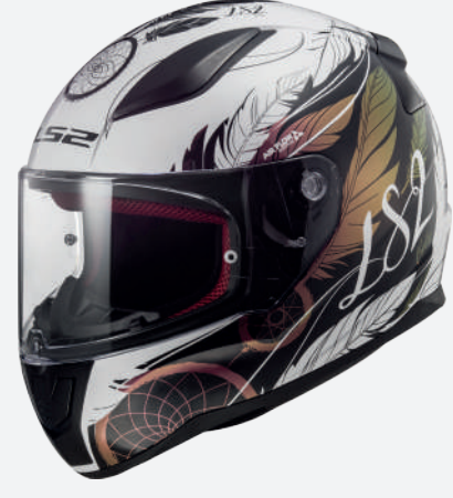
BOHO White Black Pink 10353 26 15