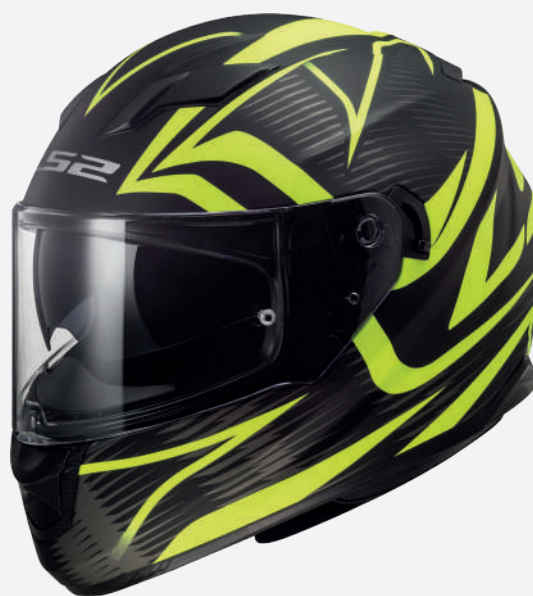
JINK Matt Black H-V Yellow 10320 42 54