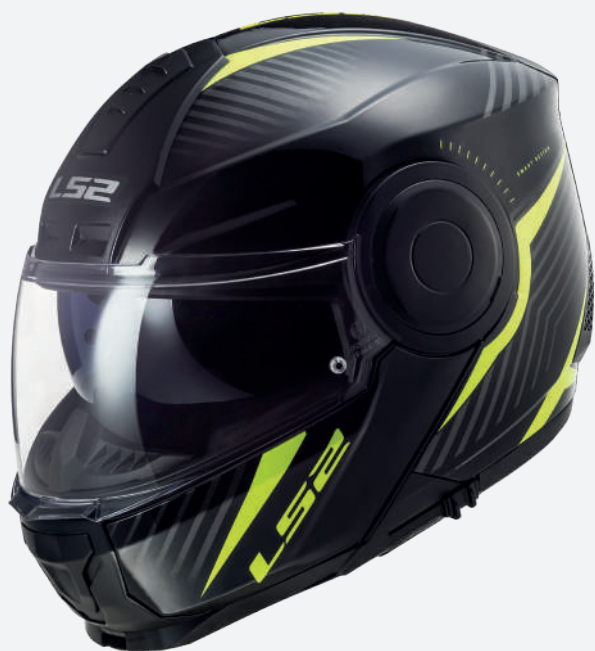
SKID Black H-V Yellow 50902 20 54