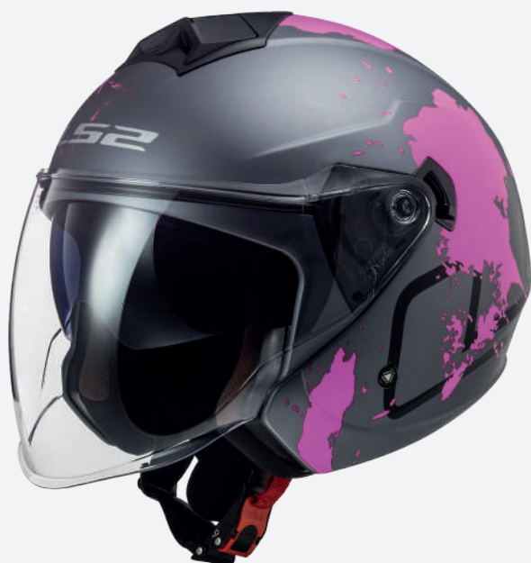
XOVER Matt Titanium Purple 30573 42 74