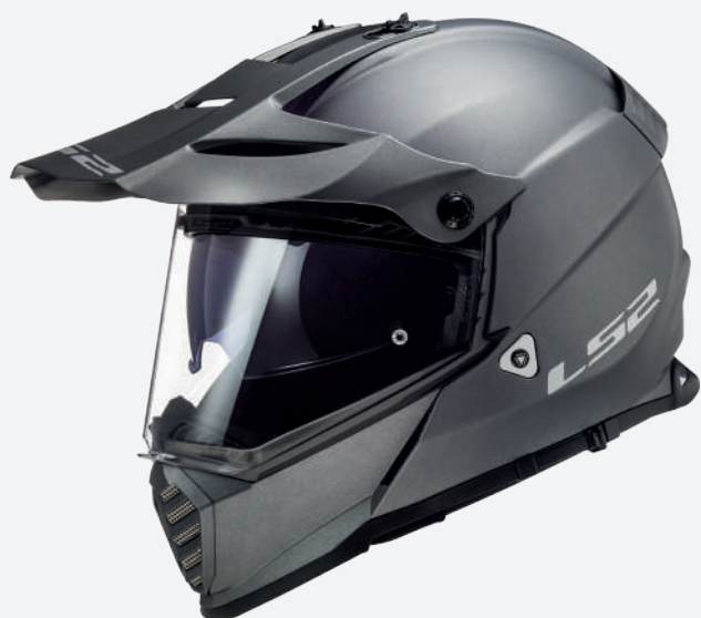
SOLID Titanium 40436 20 07