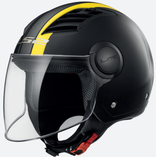
METROPOLIS Matt Black Yellow 30562 53 11