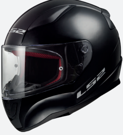
SOLID Black 10353 10 12