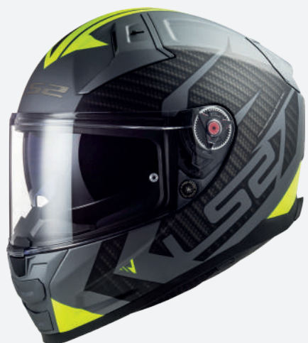
SPLITTER Matt Titanium H-V Yellow 16811 20 53