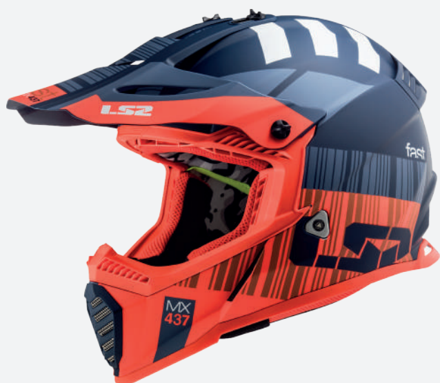
XCODE Matt Fluo Orange Blue 40437 37 52