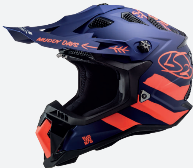
CARGO Matt Blue Fluo Orange 46700 23 23