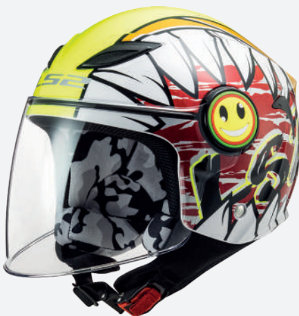
CRUNCH White H-V Yellow 30602 21 54