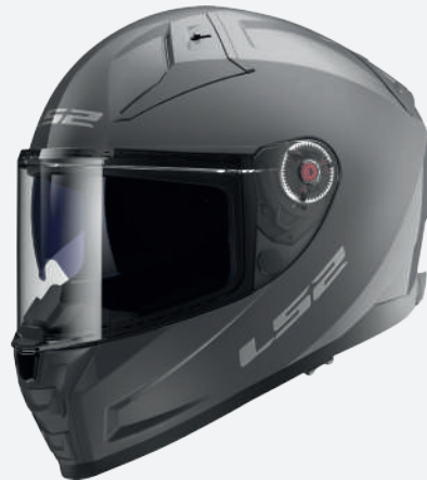
SOLID Nardo Grey 16811 10 06