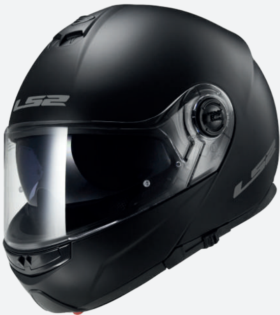
SOLID Matt Black 50325 10 11