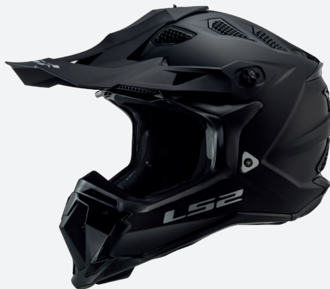
NOIR Matt Black 46700 14 11