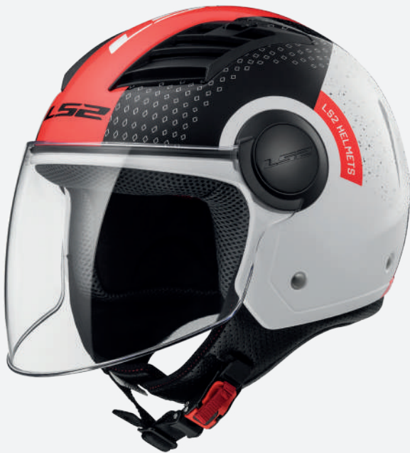
CONDOR White Black Red 30562 52 32