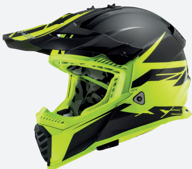
ROAR Matt Black H-V Yellow 40437 32 54