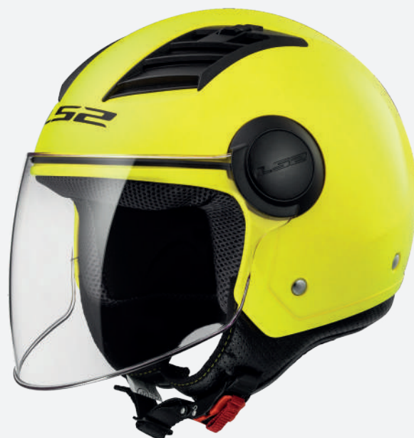
SOLID H-V Yellow 30562 50 53