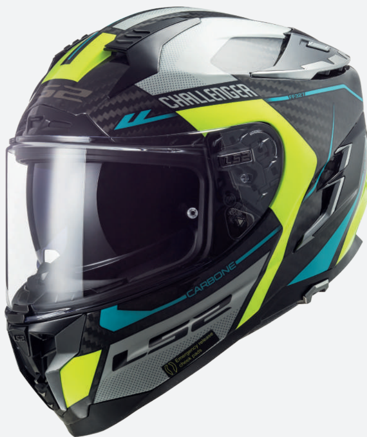
THORN H-V Yellow 10327 81 54