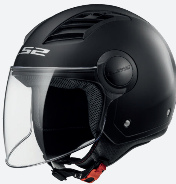
SOLID Matt Black 30562 50 11