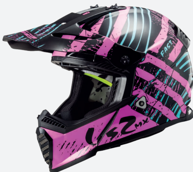
VERVE Black Fluo Pink 40437 41 46