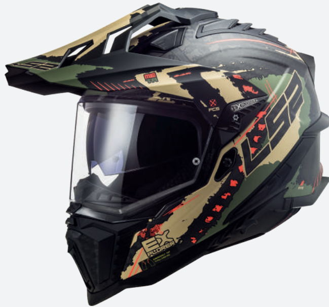
EXTEND Matt Military Green 46701 70 61