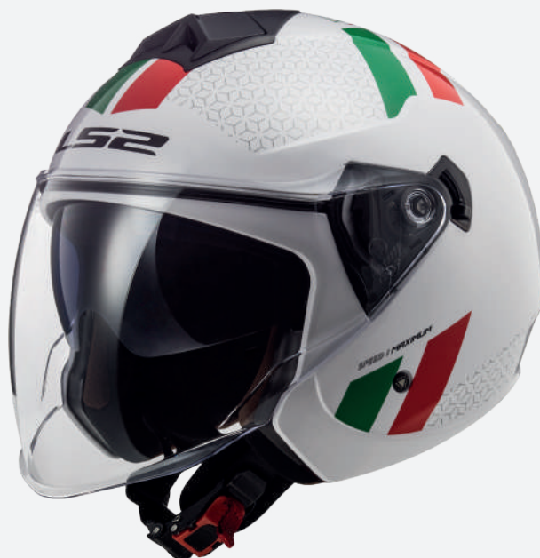
COMBO White Green Red 30573 41 02