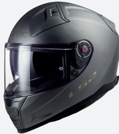
SOLID Matt Titanium 16811 10 07