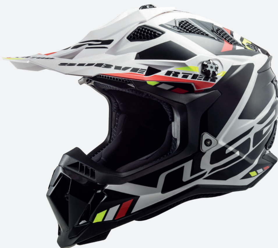
STOMP White Black 46700 30 02