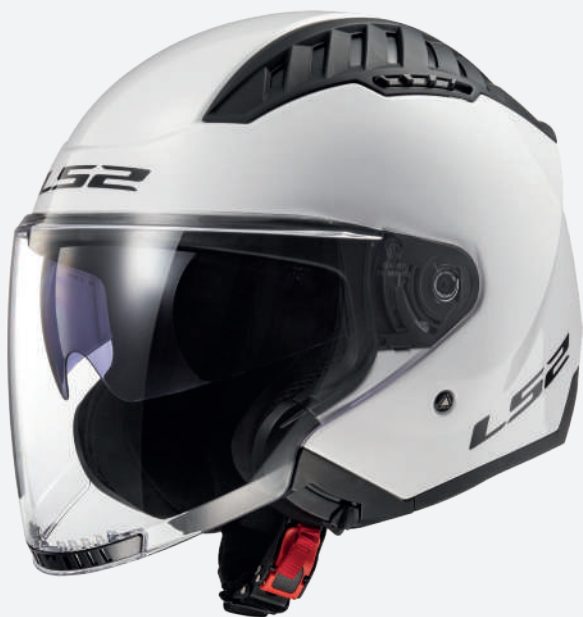
SOLID White 30600 10 02