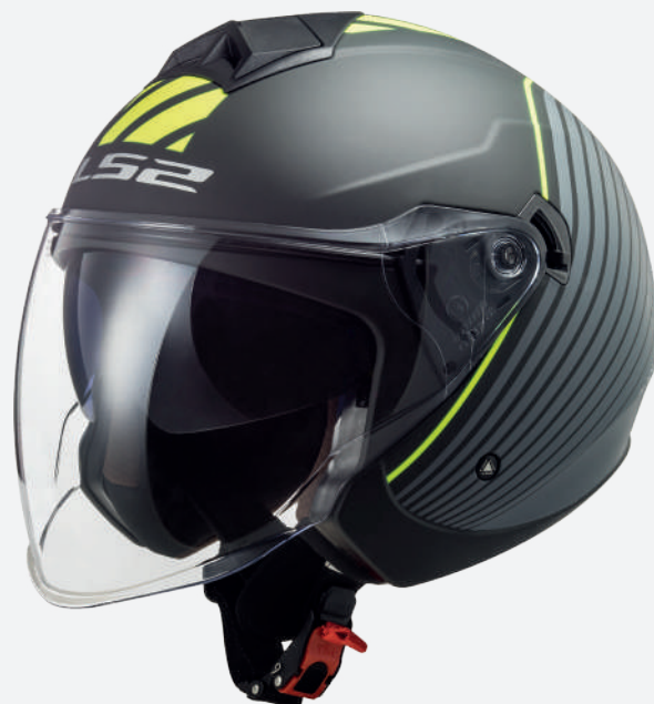
LUNA Matt Black Titanium 30573 50 11