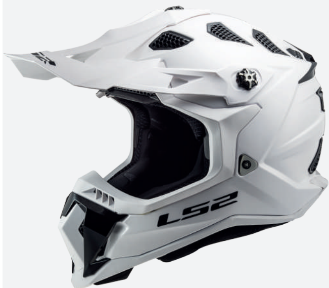
SOLID White 46700 10 02