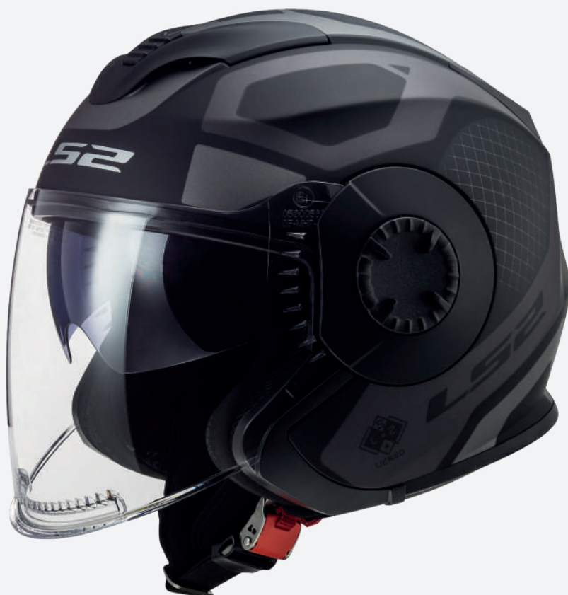
MARKER Matt Black Titanium 30570 23 07