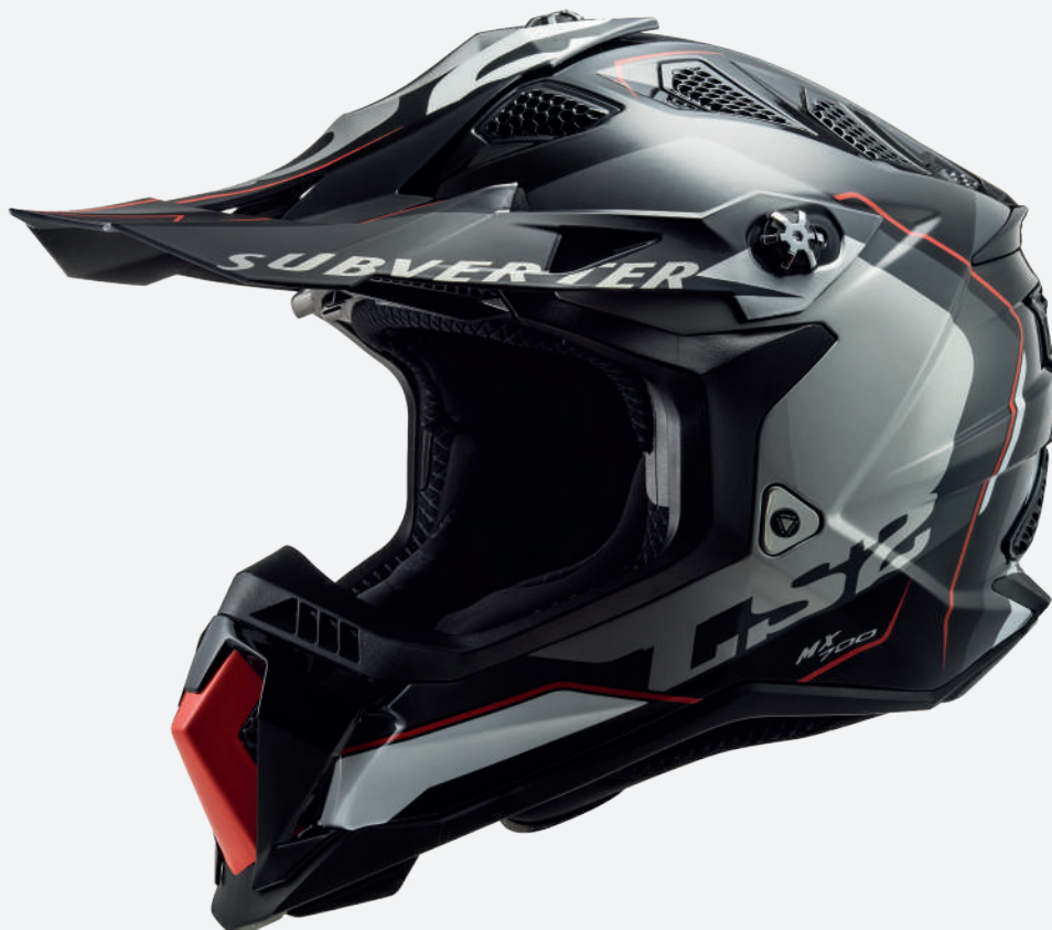
ARCHED Black Silver Titanium 46700 31 04