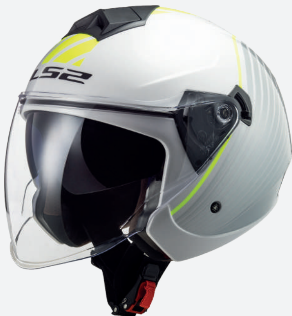
LUNA White Silver 30573 50 02