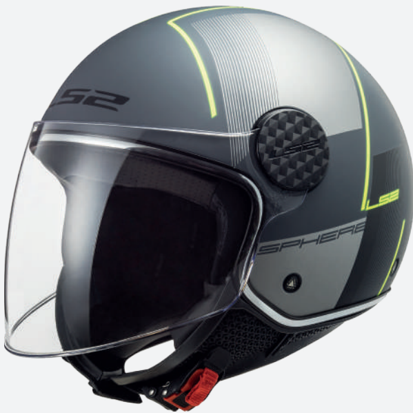
FIRM Matt Black Titanium 30558 70 07