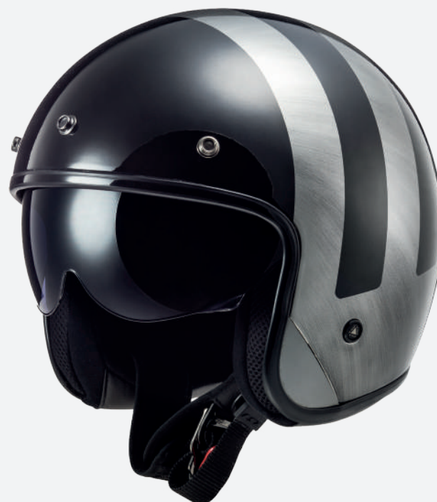
LINES Black Jeans 30601 20 08