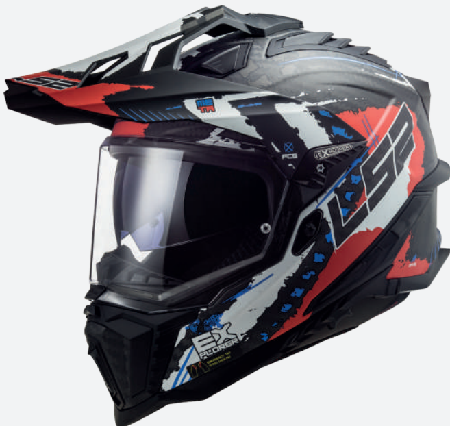
EXTEND Matt Red 46701 70 31