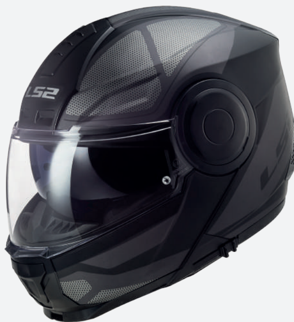
AXIS Matt Black Titanium 50902 21 08