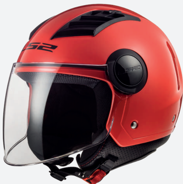
SOLID Red 30562 50 32