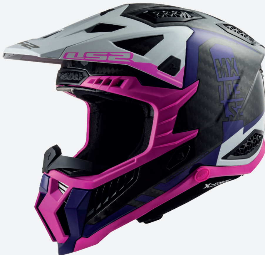
VICTORY Fluo Pink Violet 46703 22 46