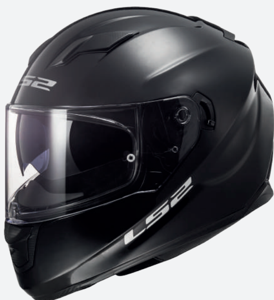
SOLID Black 10320 40 12