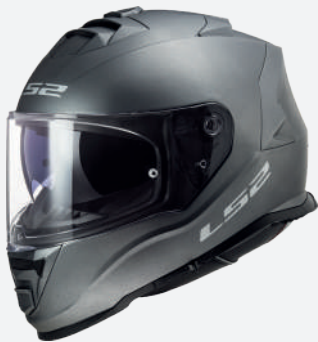
SOLID Matt Titanium 10800 10 07