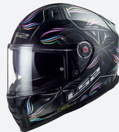
TROPICAL Black White 16811 21 12