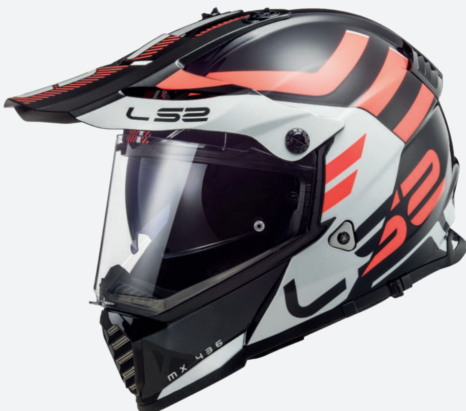
ADVENTURER Black White 40436 40 02