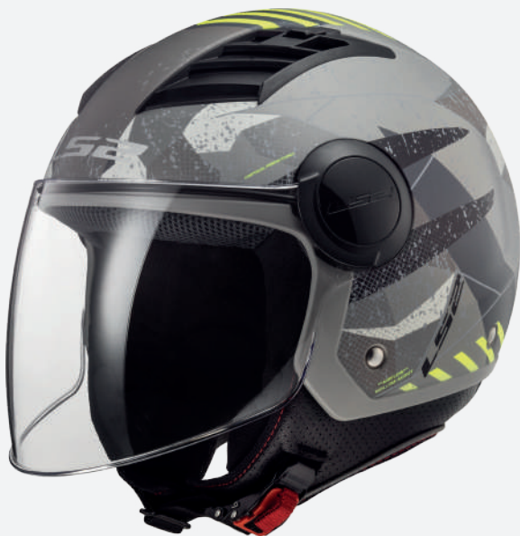
CAMO Matt Titanium Yellow 30562 54 61