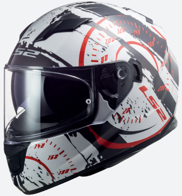
TACHO White Black Red 10320 55 02