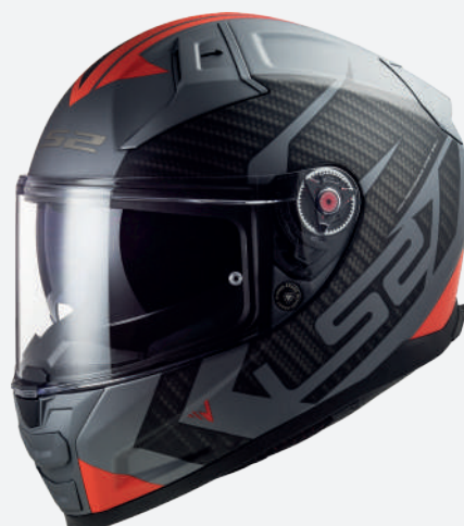
SPLITTER Matt Titanium Red 16811 20 31