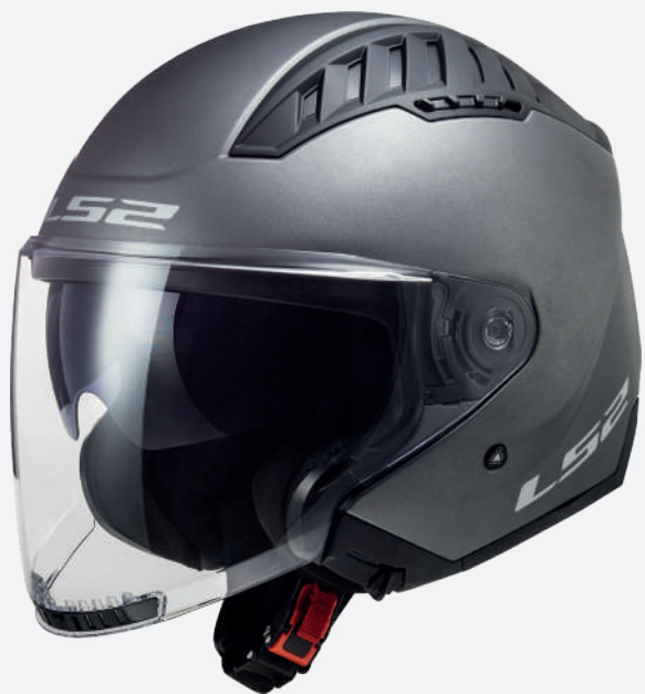
SOLID Matt Titanium 30600 10 07