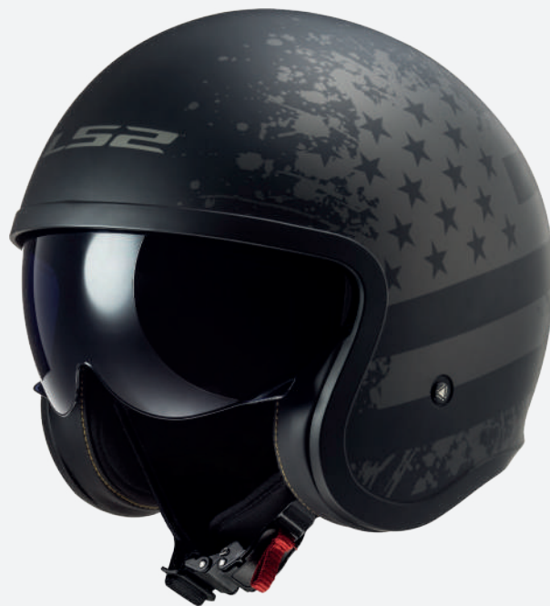
BLACK FLAG Matt Black Titanium 30599 26 11