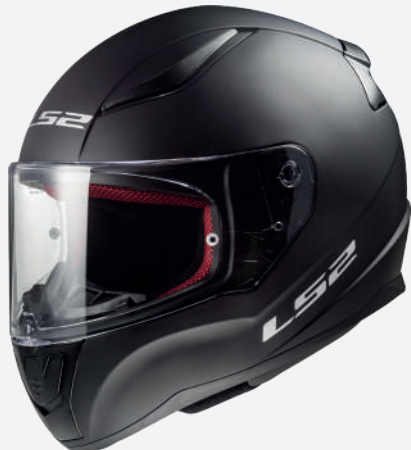
SOLID Matt Black 10353 10 11