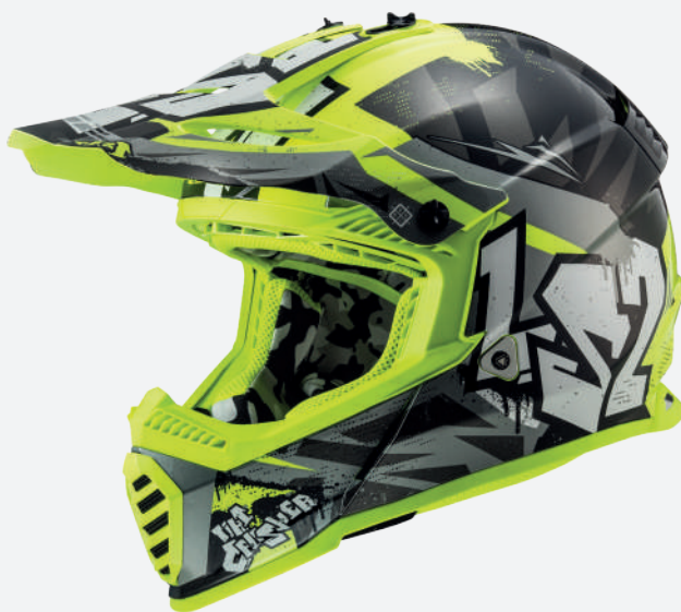
CRUSHER Black H-V Yellow 40437J 34 12