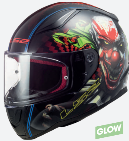
HAPPY DREAMS Black 10353 42 12