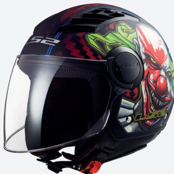
HAPPY DREAMS Matt Black Red 30562 59 11