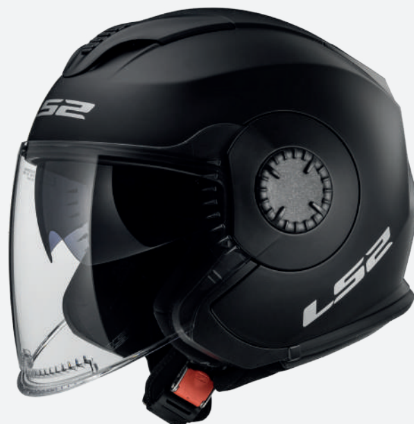
SOLID Matt Black 30570 10 11