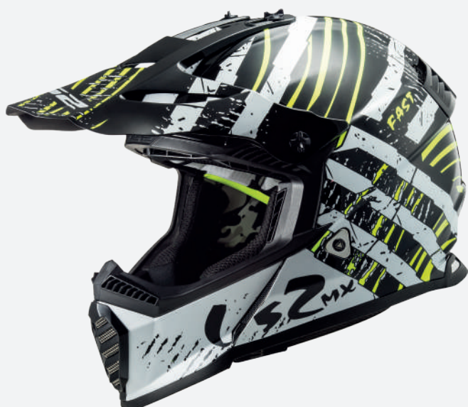
VERVE Black White 40437 41 02