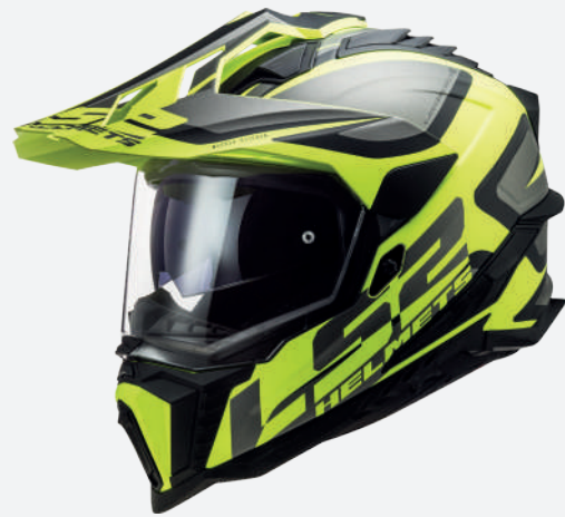
ALTER Matt Black H-V Yellow 46701 21 54