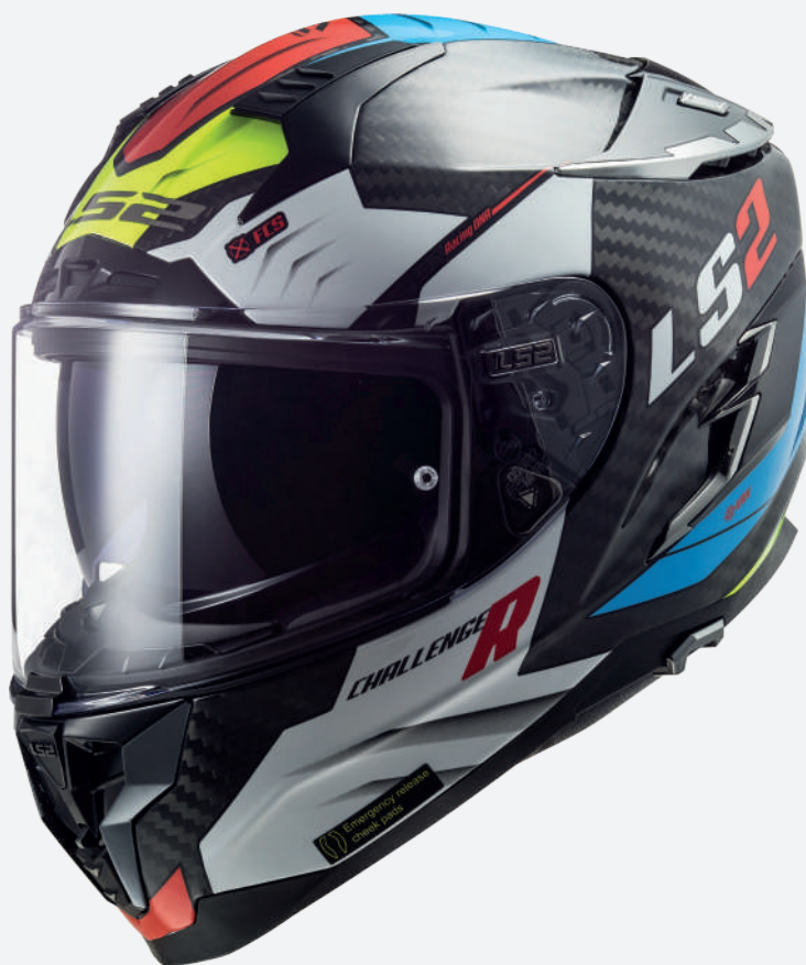
SPORTY White 10327 82 02