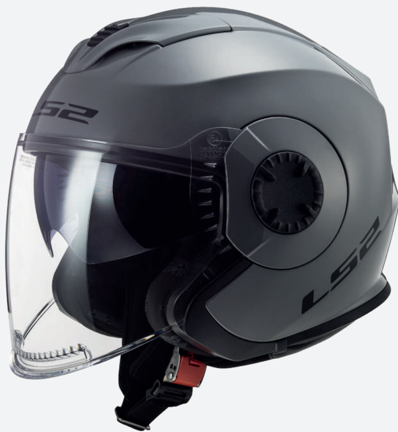
SOLID Nardo Grey 30570 37 04