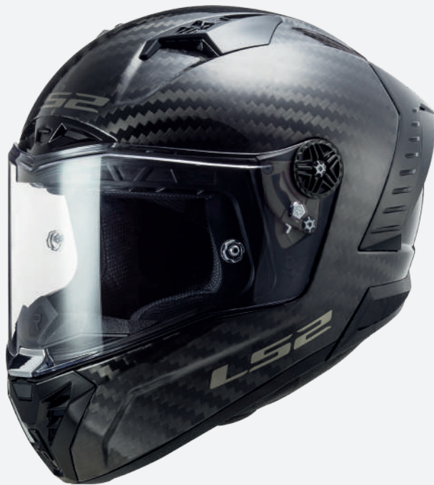
SOLID Carbon 16805 70 99