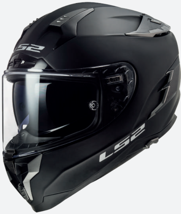
SOLID Matt Black 10327 10 11