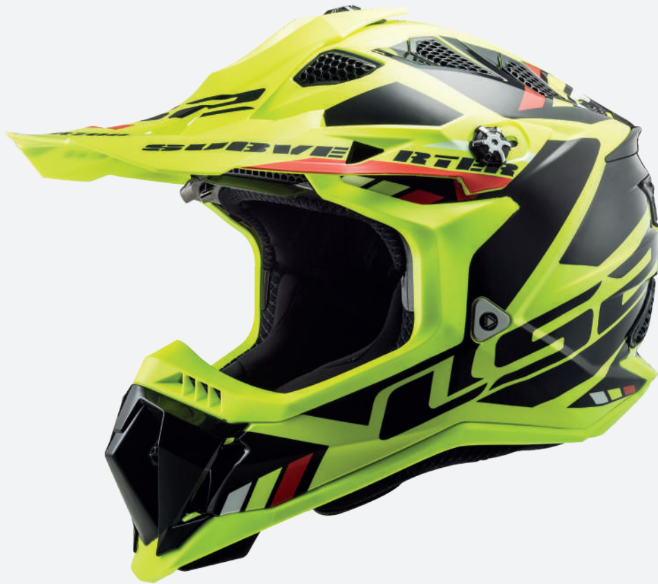
STOMP H-V Yellow Black 46700 30 54