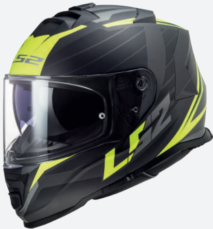
NERVE Matt Black H-V Yellow 10800 20 60