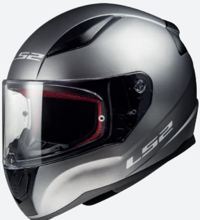
SOLID Matt Titanium 10353 10 07