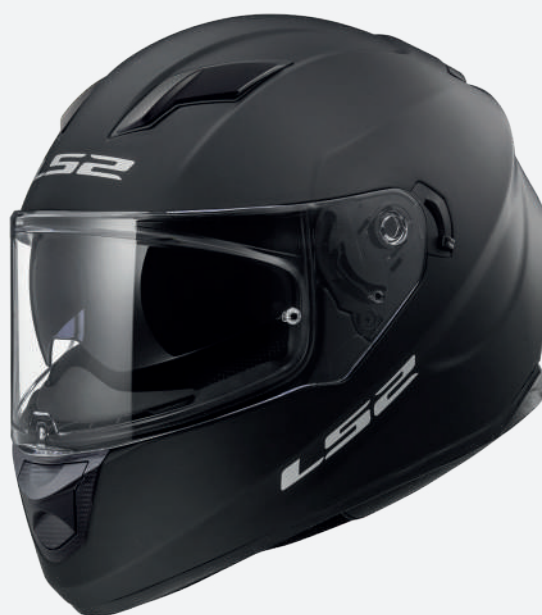
SOLID Matt Black 10320 40 11