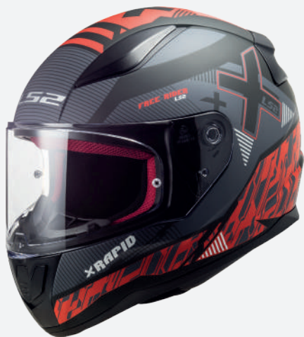
XTREET Matt Black Red 10353 61 31