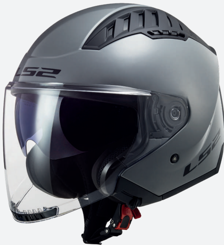
SOLID Nardo Grey 30600 37 04