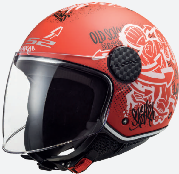
SKATER Matt Red 30558 71 31