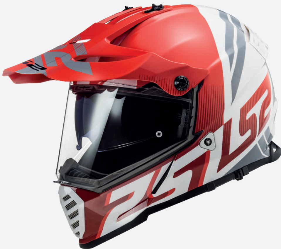
EVOLVE Red White 40436 33 32