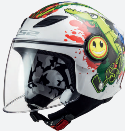
CROCO White 30602 20 61