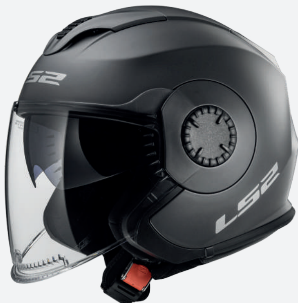
SOLID Matt Titanium 30570 10 07