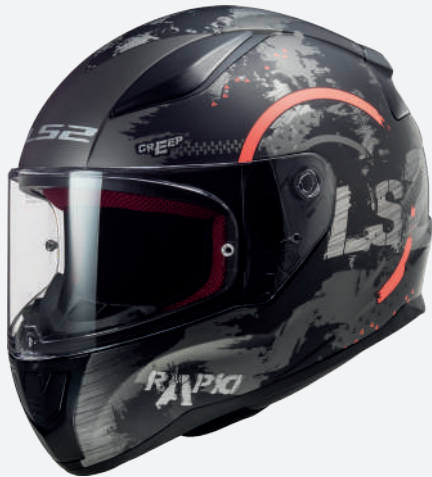
CIRCLE Matt Titanium Orange 10353 35 52