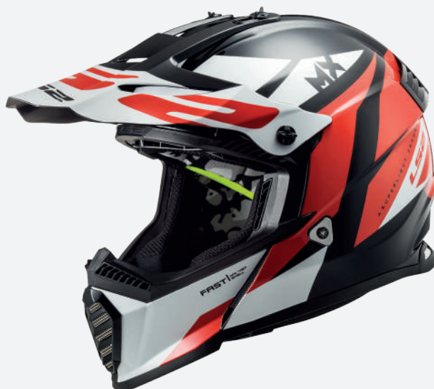
STRIKE Black White Red 40437J 40 32