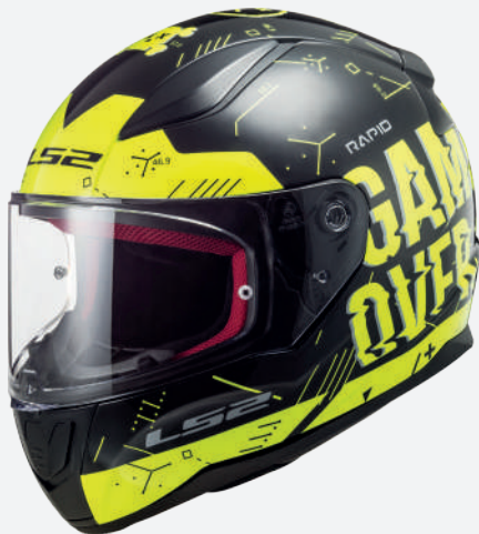
PLAYER H-V Yellow Black 10353 60 54