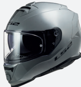
SOLID Nardo Grey 10800 37 04