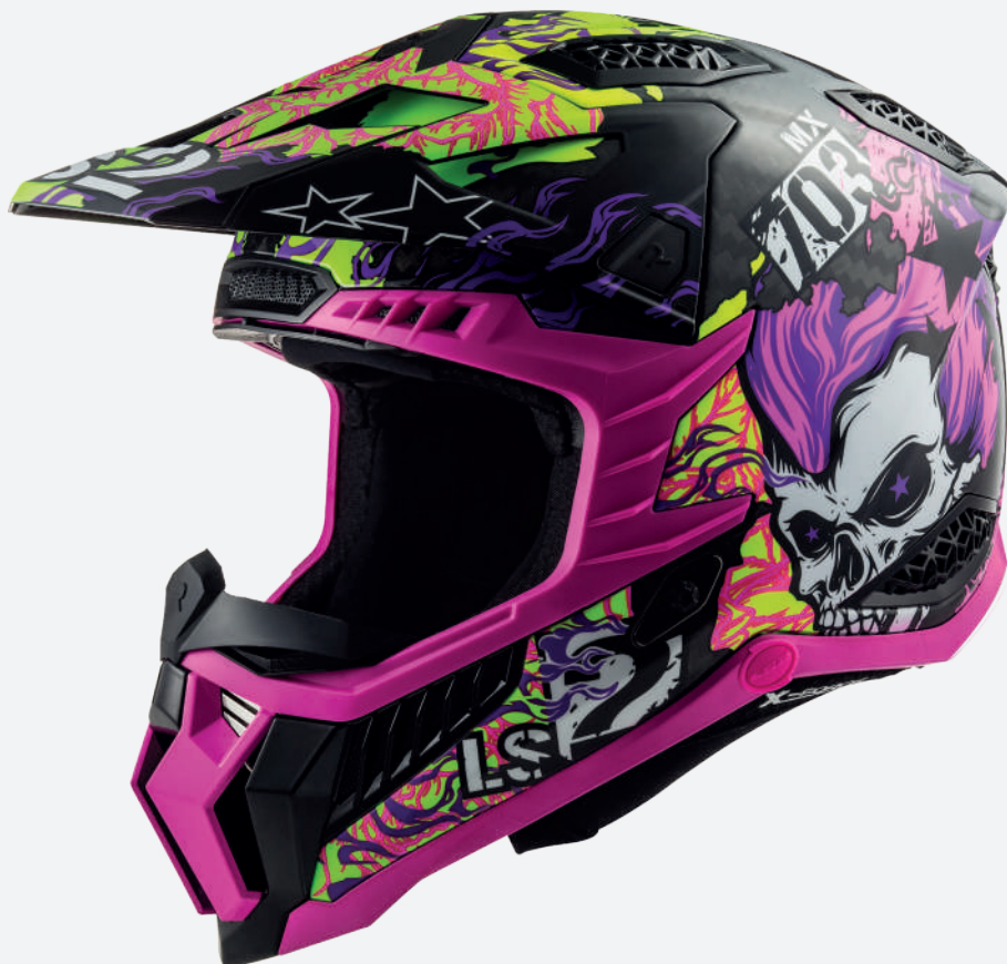
FIRESKULL Violet 46703 23 74