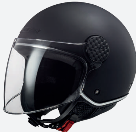
SOLID Matt Black 30558 50 11