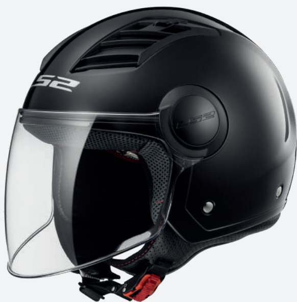
SOLID Black 30562 50 12