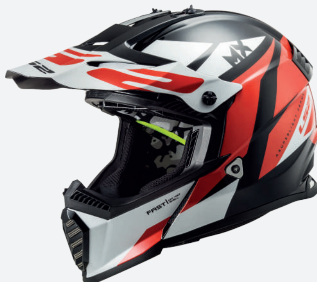
STRIKE Black White Red 40437 40 32