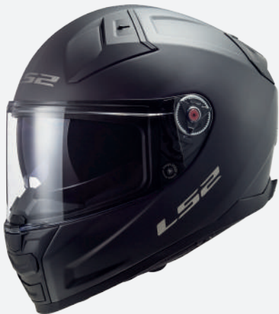
SOLID Matt Black 16811 10 11