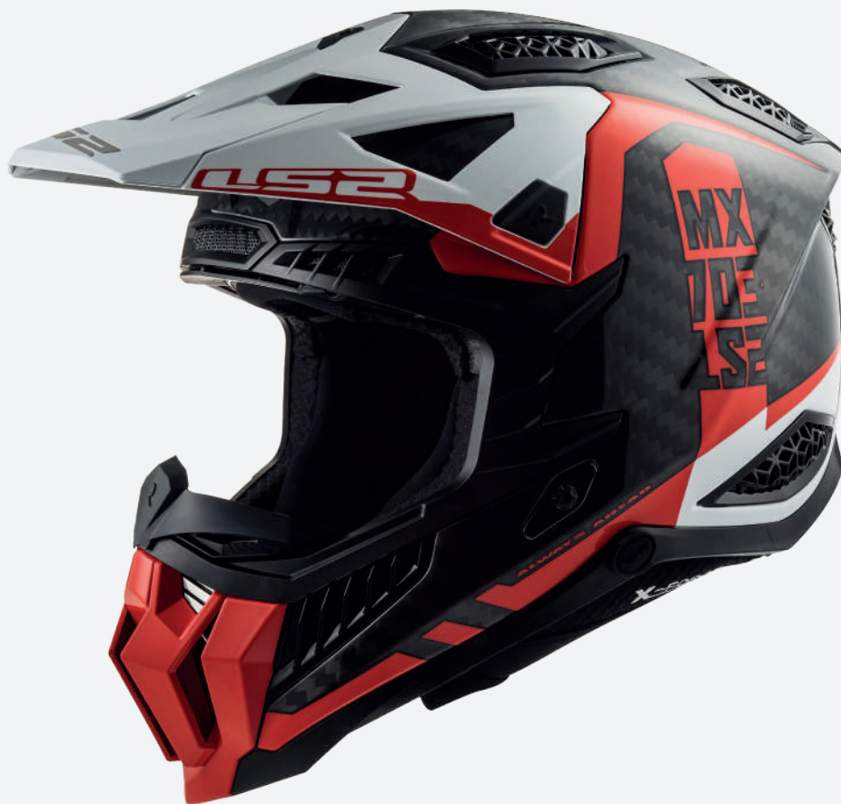
VICTORY Red White 46703 22 32