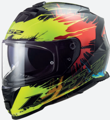
DROP Black Yellow Red 10800 31 54