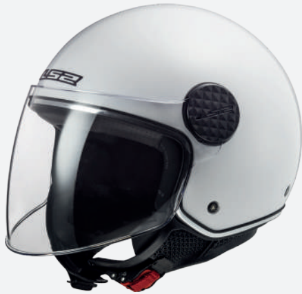
SOLID White 30558 50 02