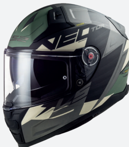
ABSOLUTE Matt Black Silver Titanium 16811 24 03