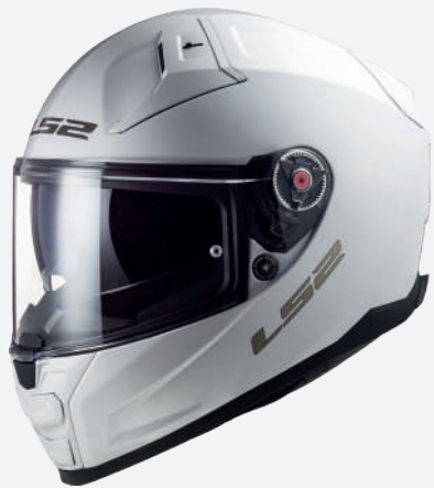
SOLID White 16811 10 02