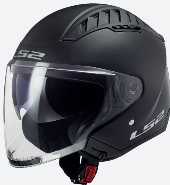
SOLID Matt Black 30600 10 11