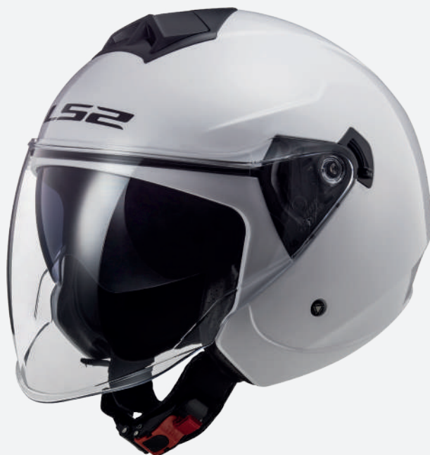
SOLID White 30573 30 02