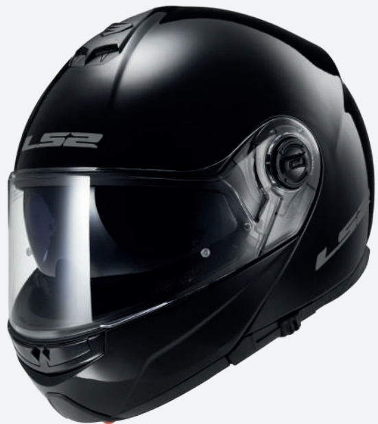
SOLID Black 50325 10 12