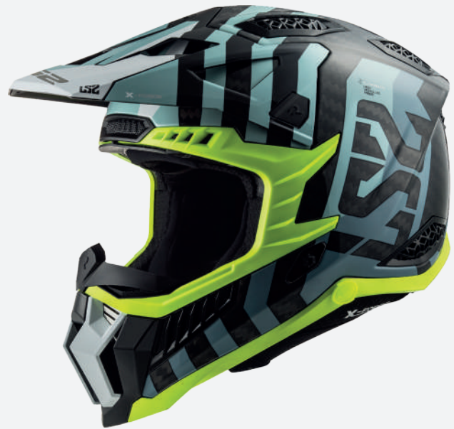
BARRIER Sky Blue 46703 21 26