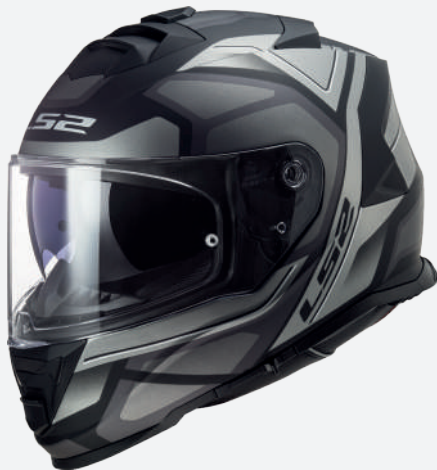
FASTER Matt Titanium 10800 22 07