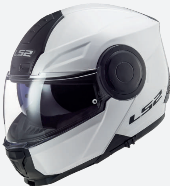
SOLID White 50902 10 02