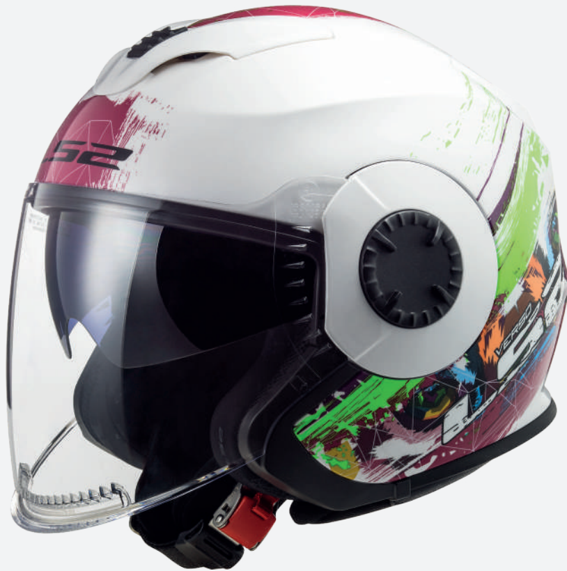
SPRING White Pink 30570 30 46