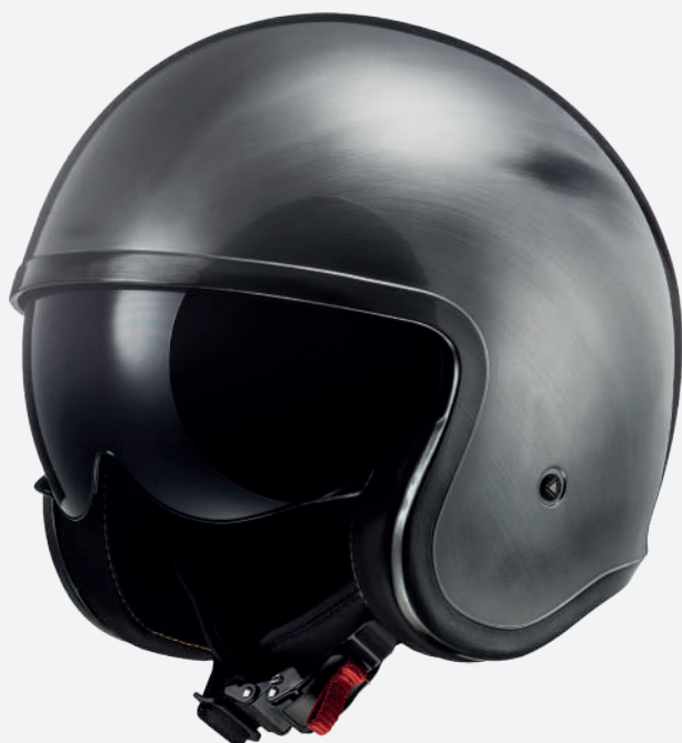
JEANS 30599 19 08