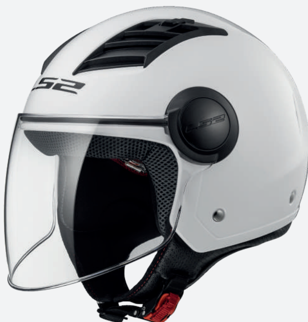
SOLID White 30562 50 02