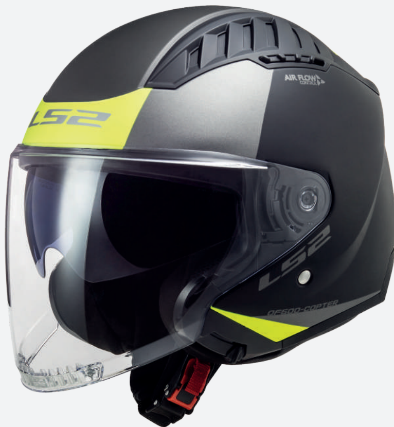
URBANE Matt Black H-V Yellow 30600 21 11