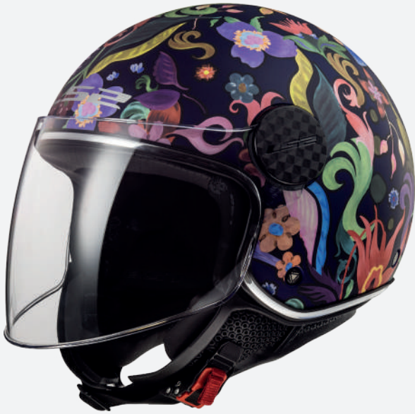
BLOOM Blue Pink 30558 61 26