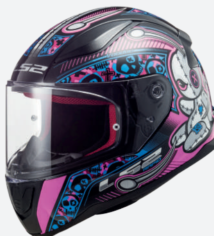
VOODOO Black Fluo Pink 10353J 31 46