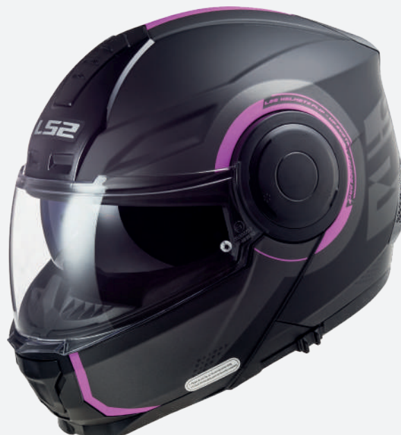
ARCH Matt Titanium Pink 50902 22 46