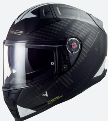
SPLITTER Black White 16811 20 12