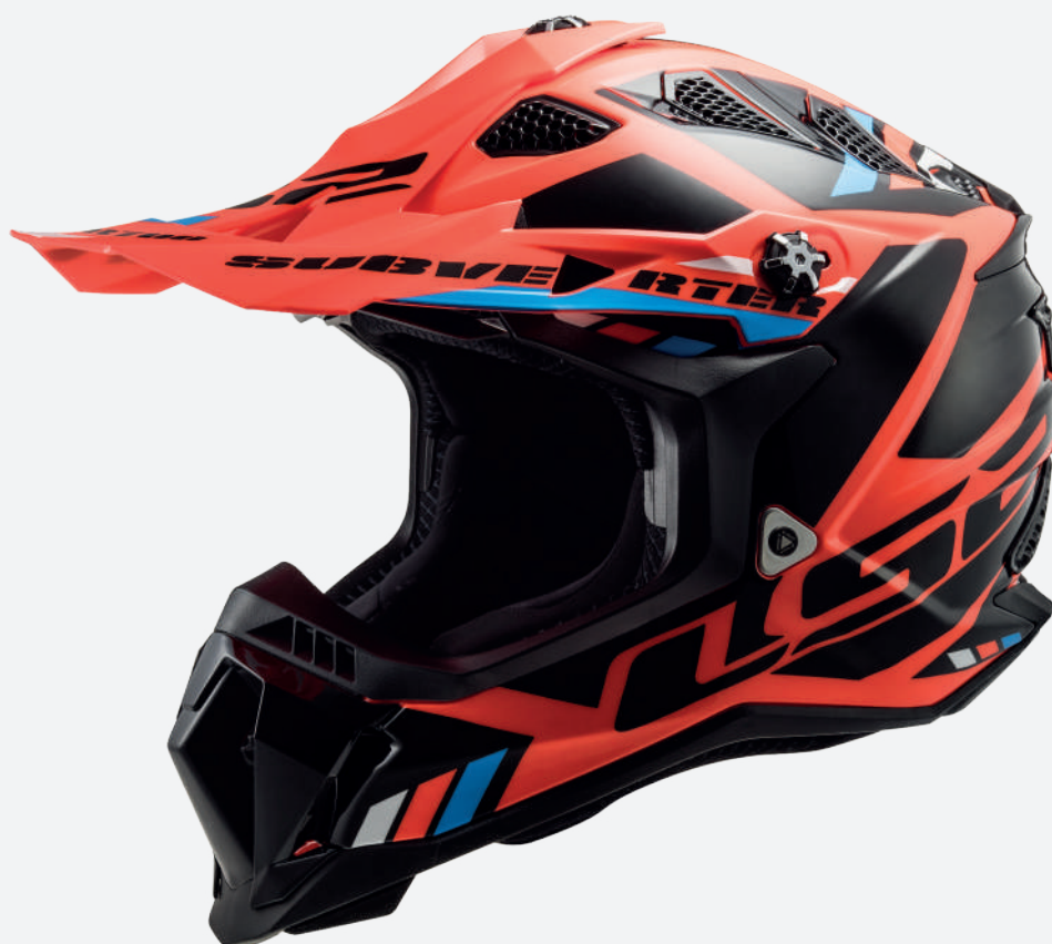
STOMP Fluo Orange Black 46700 30 52