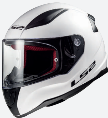
SOLID White 10353 10 02