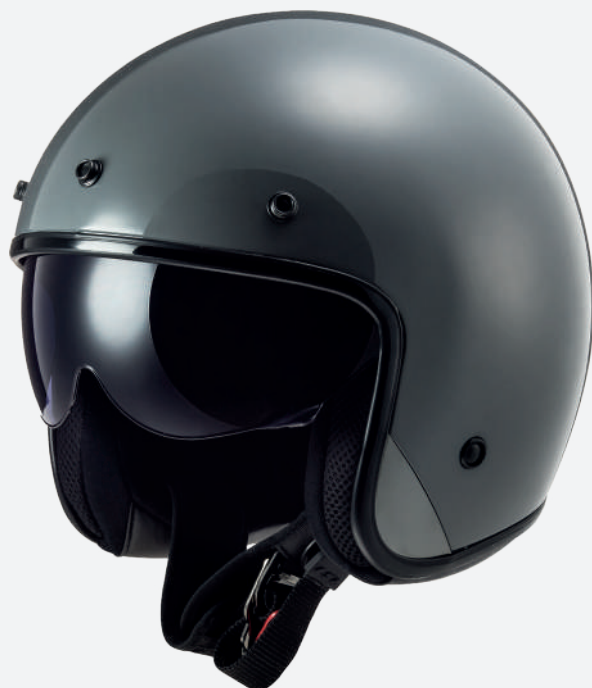
SOLID Nardo Grey 30601 37 04