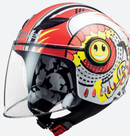
SLUCH Red White 30602 22 32