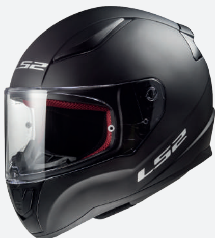
SOLID Matt Black 10353J 10 11