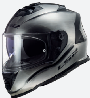
JEANS 10800 19 08