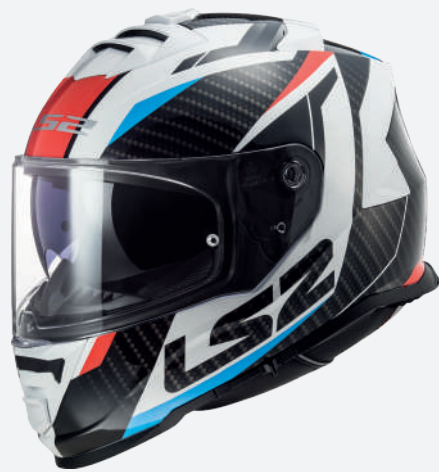
RACER Blue Red 10800 21 32