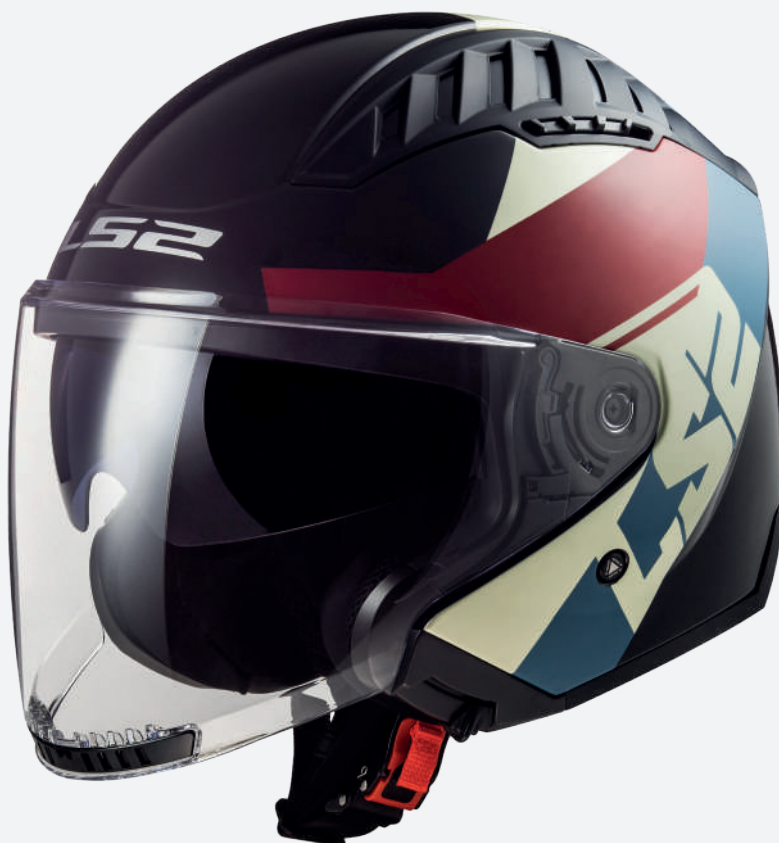
NEW RISE Matt Black Red Blue 30600 31 26