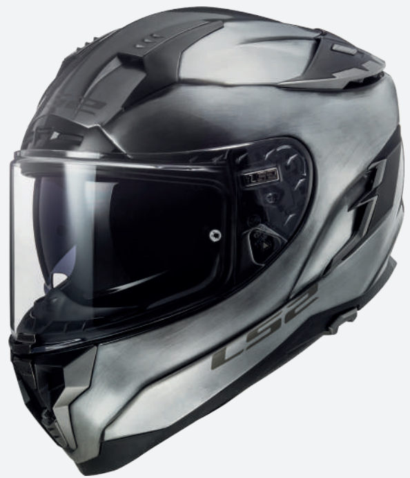
JEANS Titanium 10327 19 08