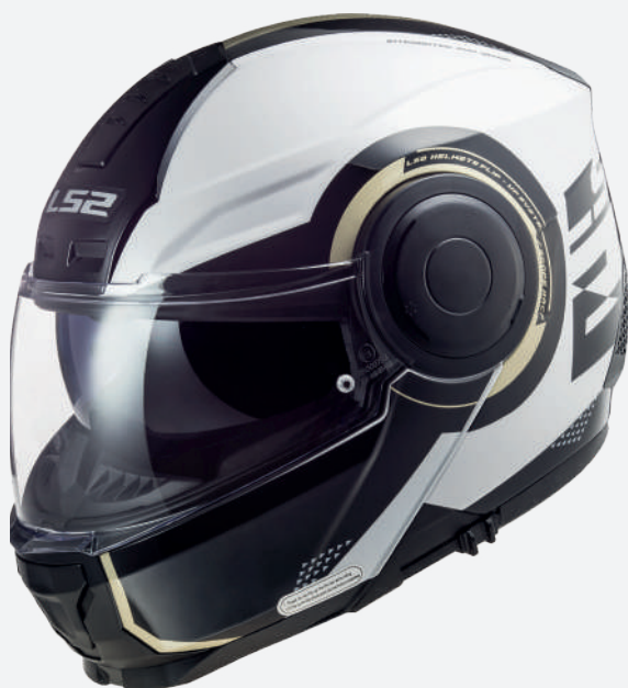
ARCH White Titanium 50902 22 08