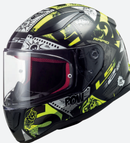
VIGNETTE Black H-V Yellow 10353J 30 54