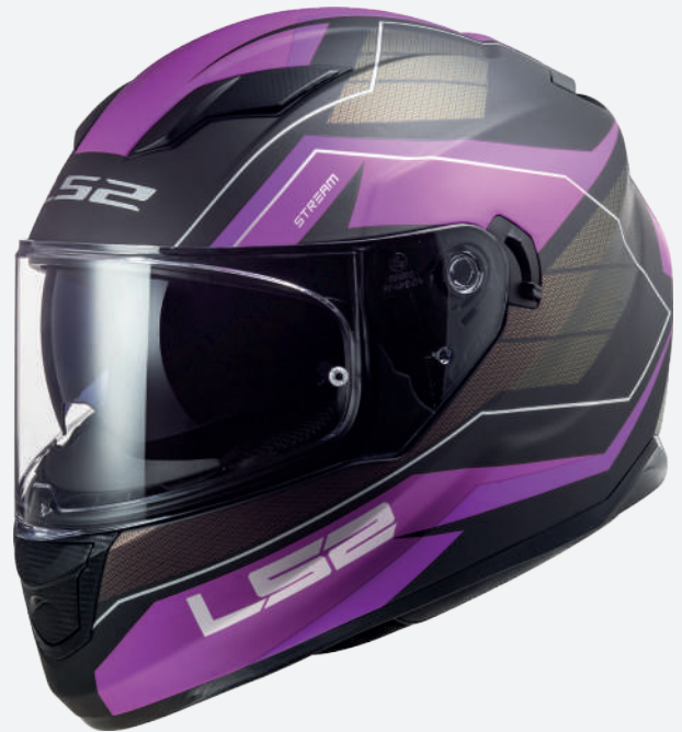
MERCURY Matt Titanium Purple 10320 56 74