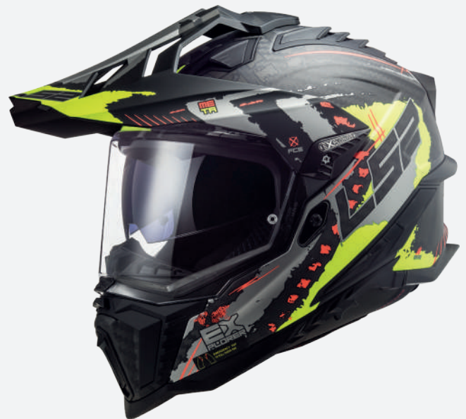
EXTEND Matt H-V Yellow 46701 70 53