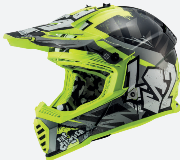
CRUSHER Black H-V Yellow 40437 34 12