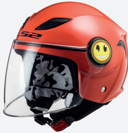
SOLID Red 30602 10 32