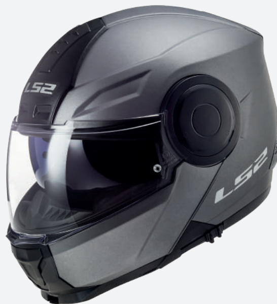
SOLID Matt Titanium 50902 10 07