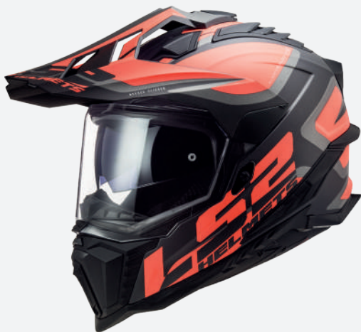
ALTER Matt Black Fluo Orange 46701 21 52