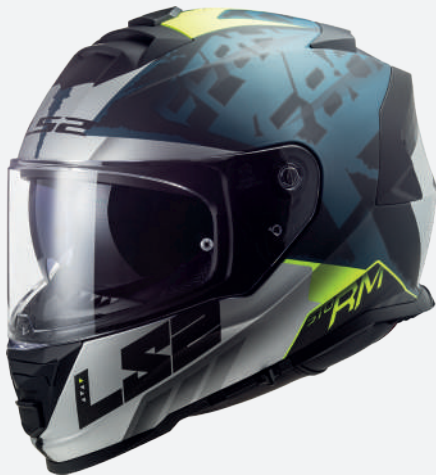
SPURTER Matt Black Silver Cobalt 10800 32 03