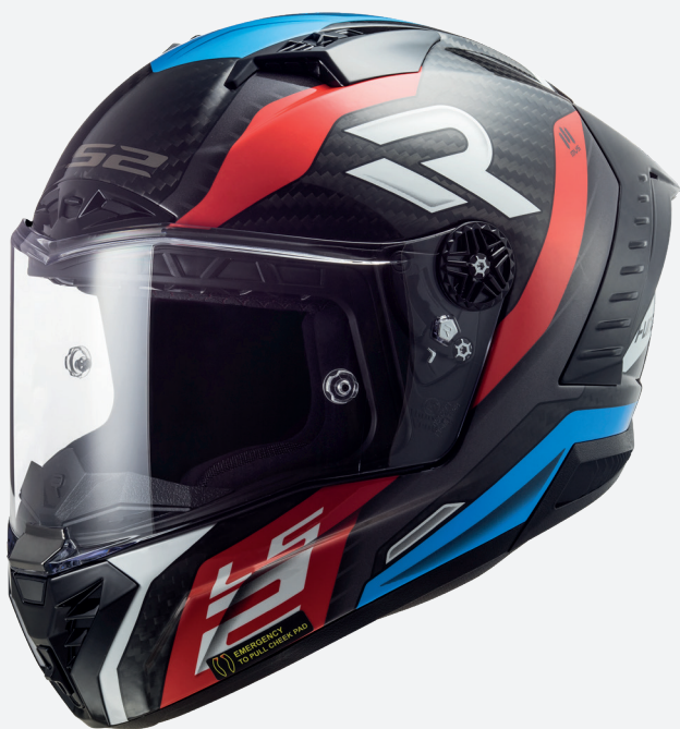
SUPRA Red Blue 16805 85 32