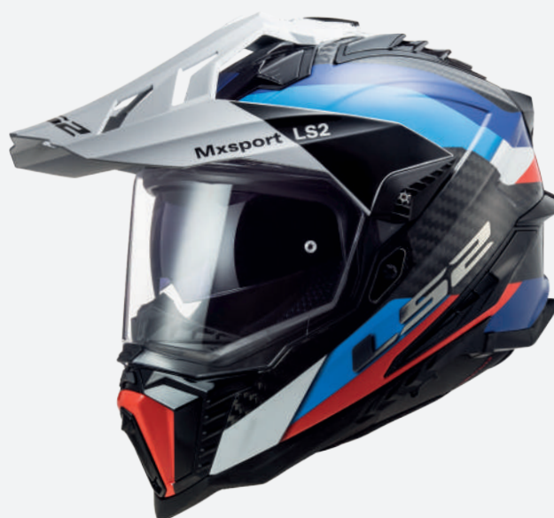
FRONTIER Black Blue 46701 61 12