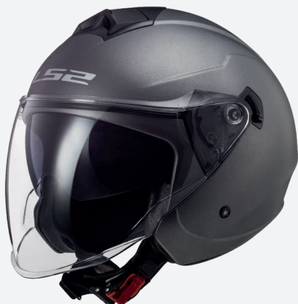
SOLID Matt Titanium 30573 30 07