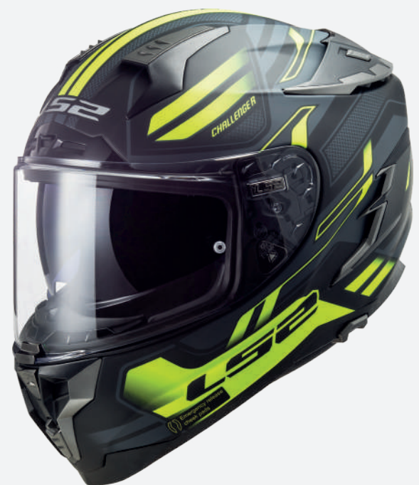
SPIN Matt Black Cobalt H-V Yellow 10327 50 53