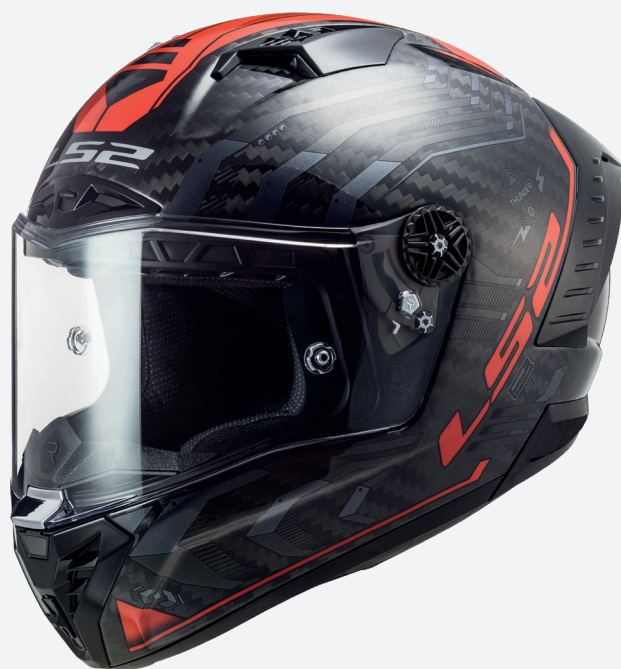
SPUTNIK Metal Red 16805 82 32