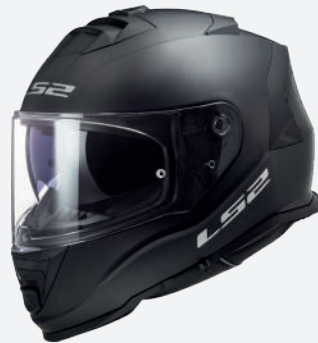
SOLID Matt Black 10800 10 11