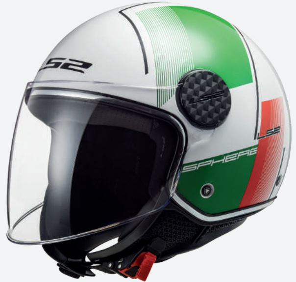
FIRM White Green Red 30558 70 60