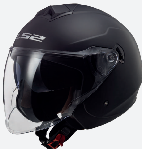
SOLID Matt Black 30573 30 11