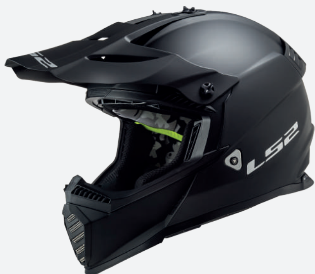
SOLID Matt Black 40437 20 11