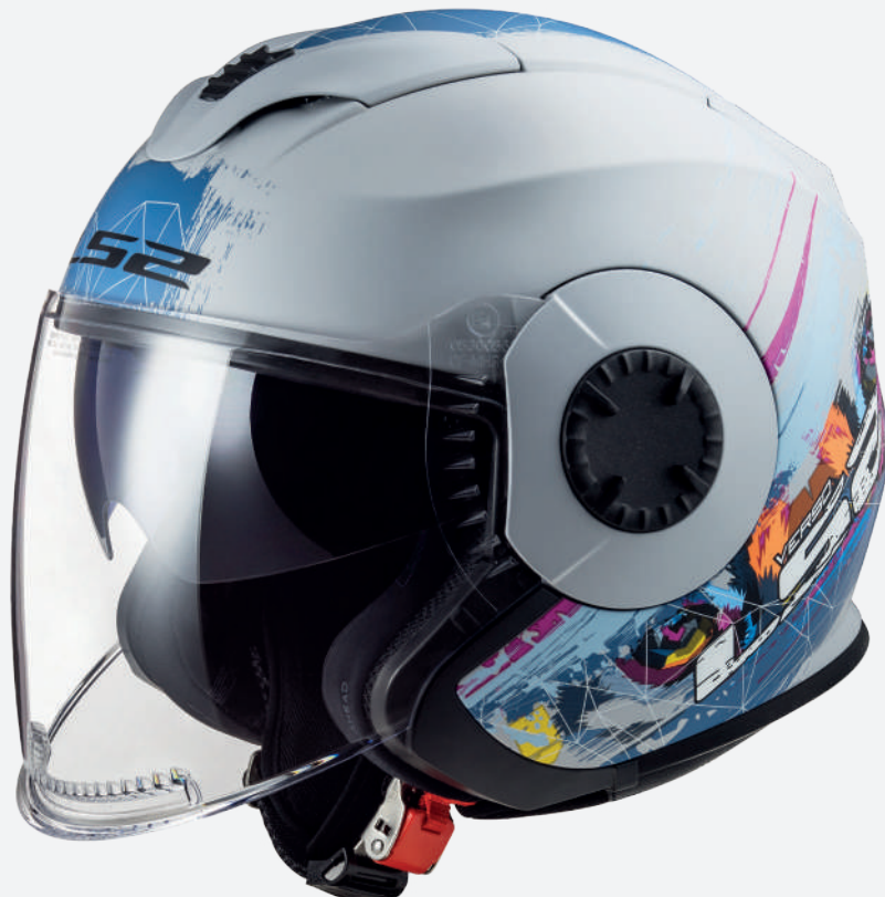
SPRING Matt Silver Blue 30570 30 25