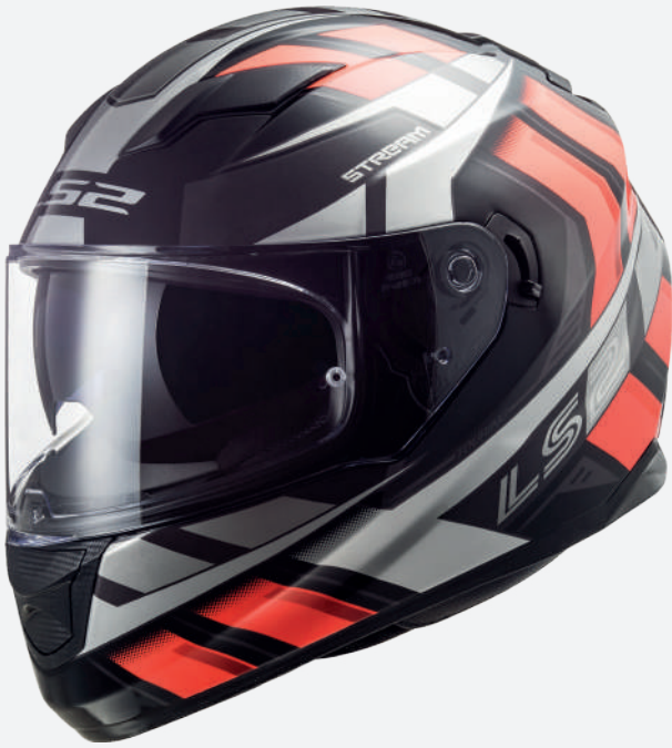
LOOP Black Red 10320 70 32