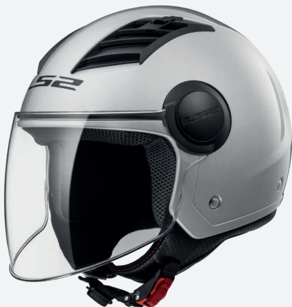
SOLID Silver 30562 50 04