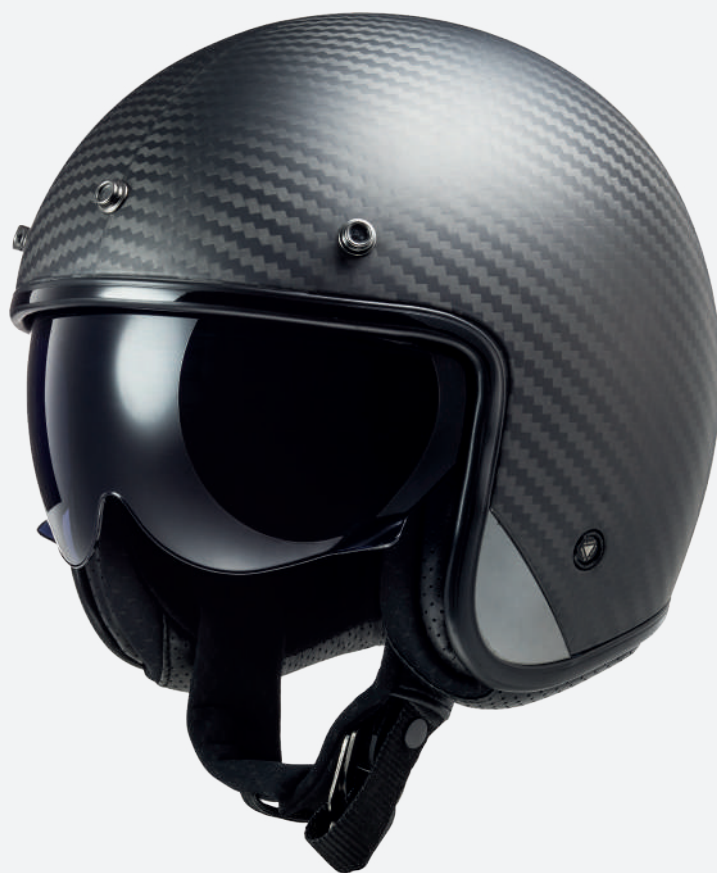
SOLID Matt Carbon 30601 10 98