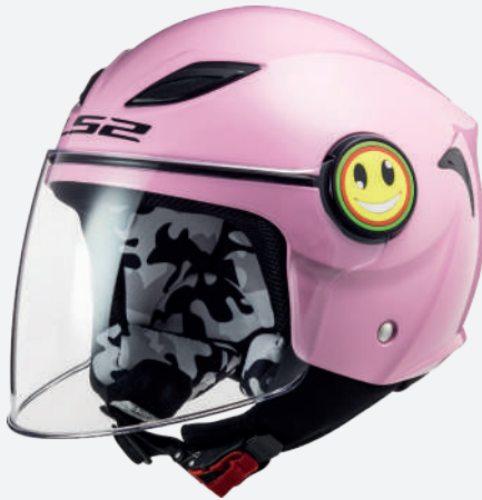
SOLID Pink 30602 10 46