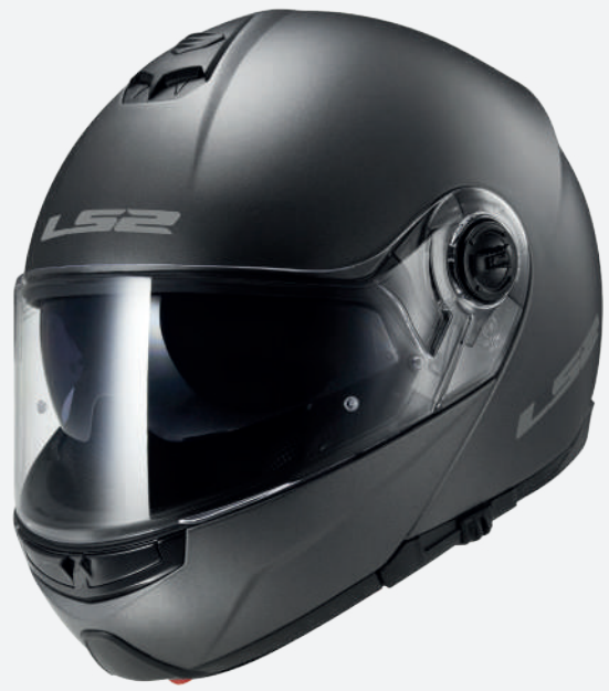
SOLID Matt Titanium 50325 10 07