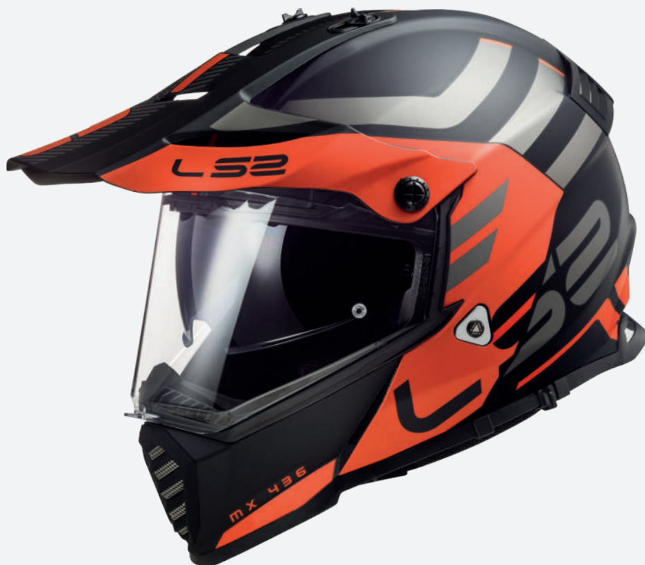
ADVENTURER Matt Black Orange 40436 40 51