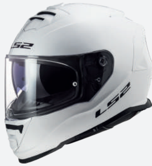
SOLID White 10800 10 02