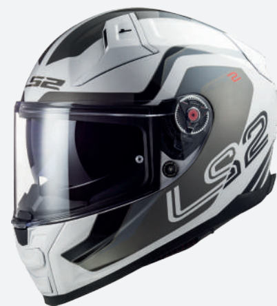
METRIC White Titanium Silver 16811 23 08