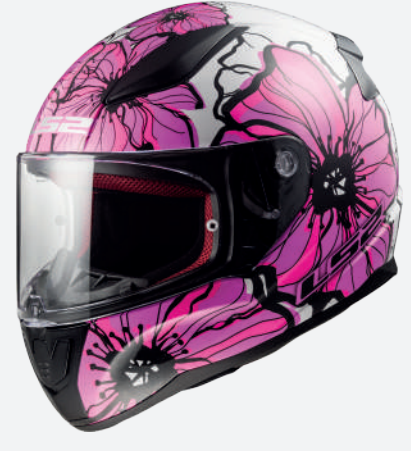
POPPIES Pink 10353 20 46