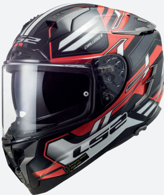
SPIN Black Red White 10327 50 02