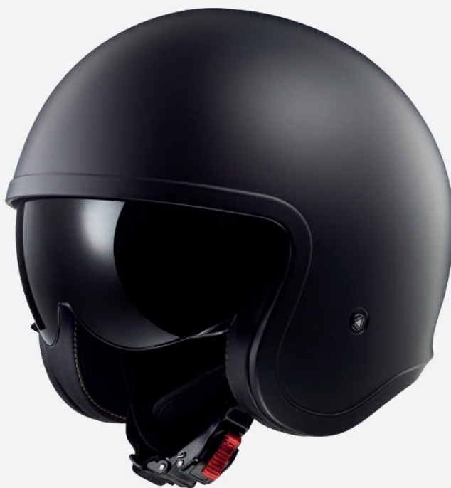
SOLID Matt Black 30599 10 11