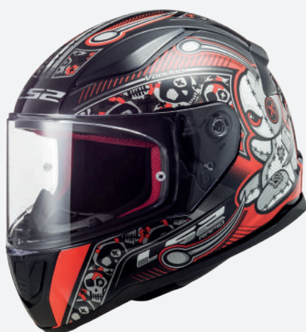
VOODOO Black Red 10353J 31 32