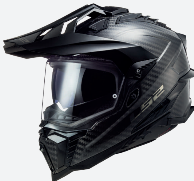
SOLID Carbon 46701 50 99