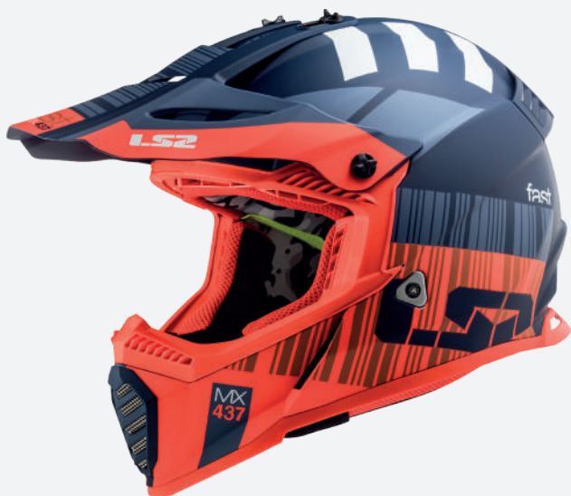
XCODE Matt Fluo Orange Blue 40437J 37 52