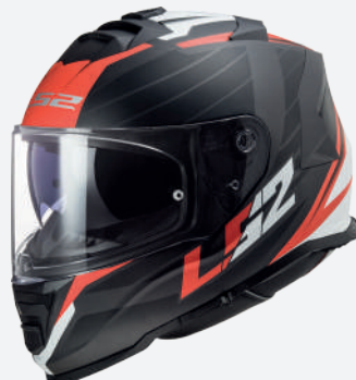
NERVE Matt Black Red 10800 20 32