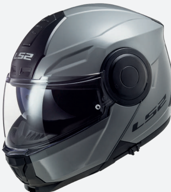
SOLID Nardo Grey 50902 37 04