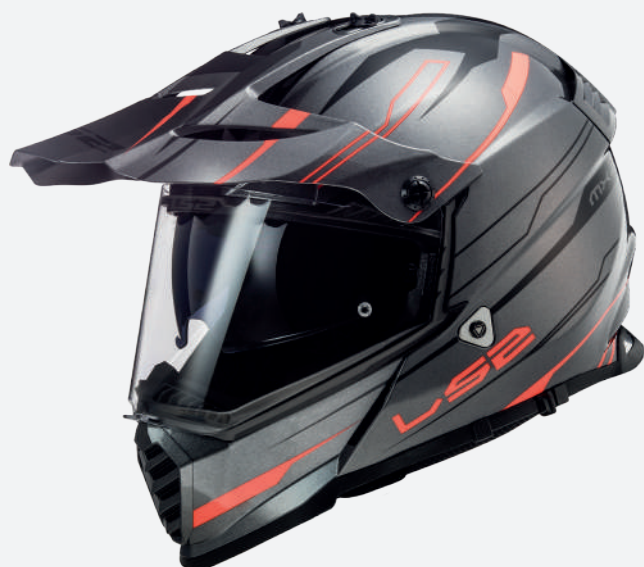
KNIGHT Titanium Fluo Orange 40436 28 50