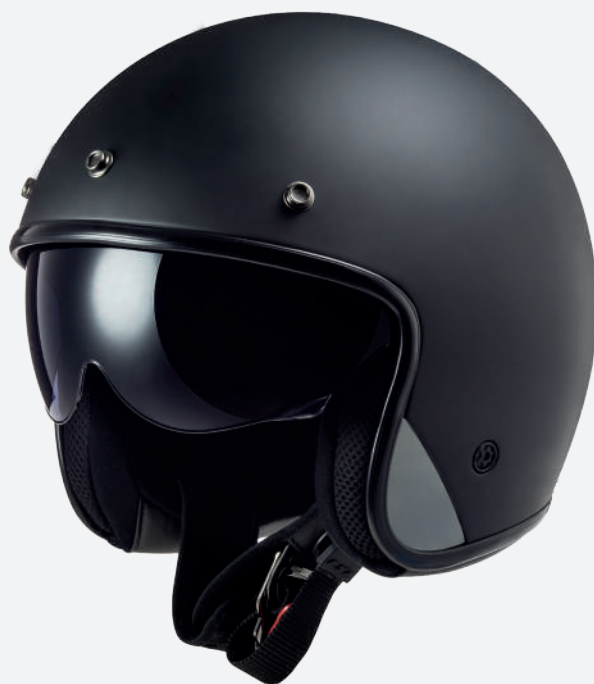
SOLID Matt Black 30601 10 11