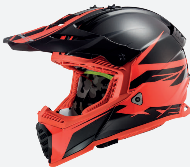
ROAR Matt Black Red 40437 32 32