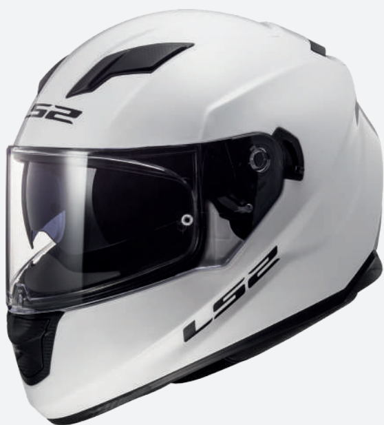
SOLID White 10320 40 02