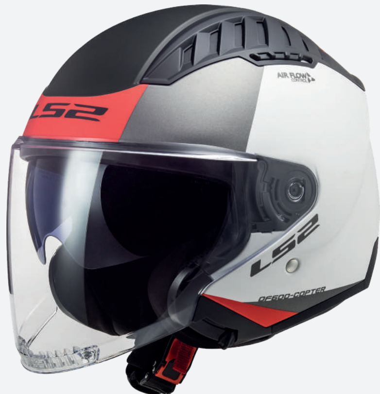
URBANE Matt White Red 30600 21 02