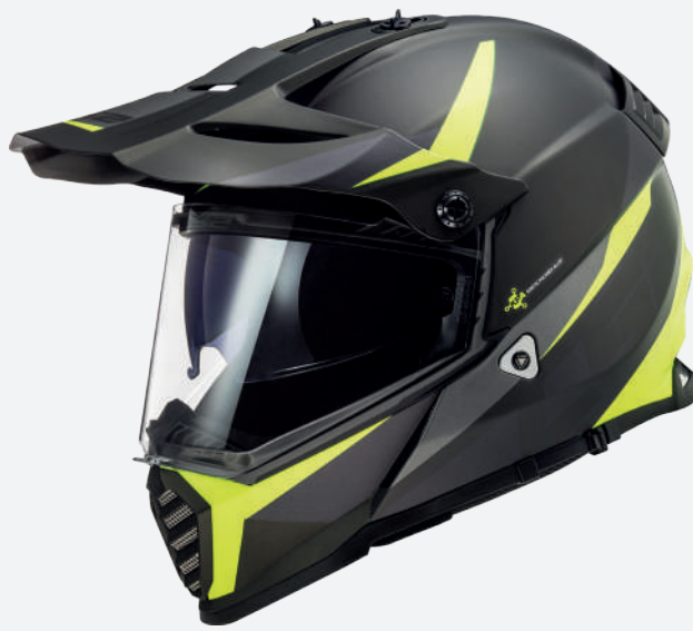
ROUTER Matt Black H-V Yellow 40436 31 54