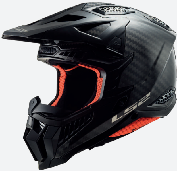
SOLID Carbon 46703 10 99