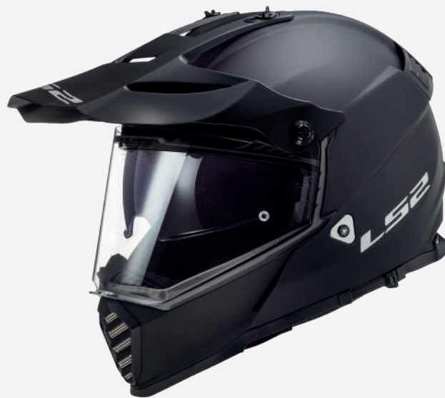
SOLID Matt Black 40436 20 11