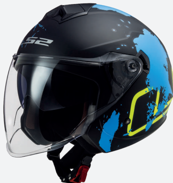
XOVER Matt Titanium Black Blue 30573 42 21