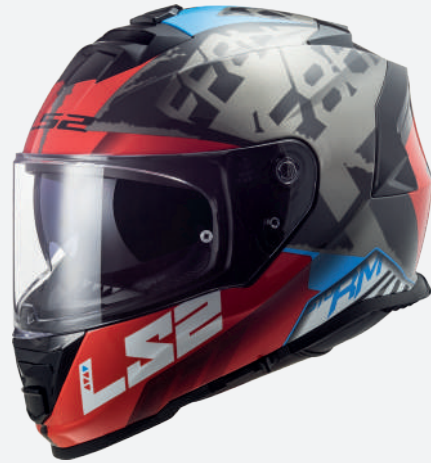
SPURTER Black Red Titanium 10800 32 32