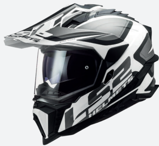
ALTER Matt Black White 46701 21 02