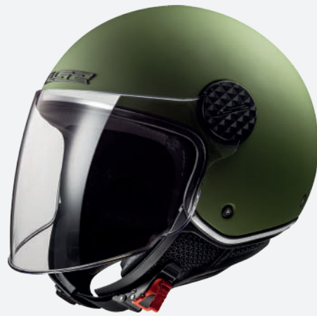
SOLID Matt Military Green 30558 50 61