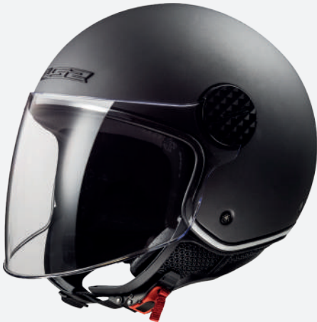
SOLID Matt Titanium 30558 50 07