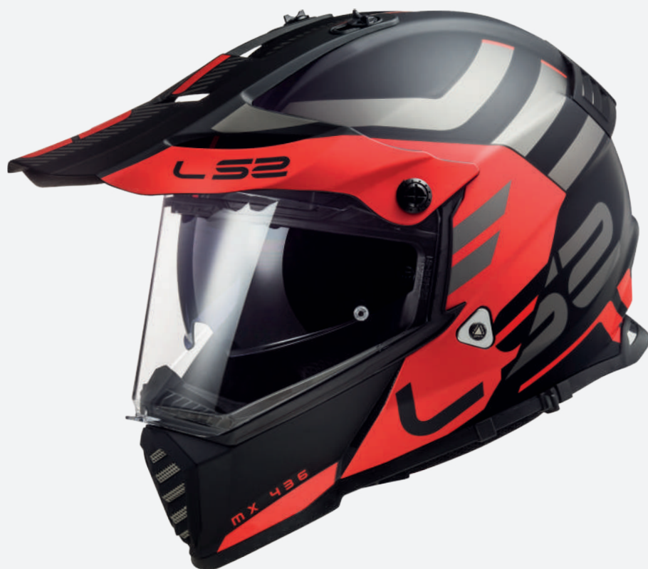
ADVENTURER Matt Black Red 40436 40 31