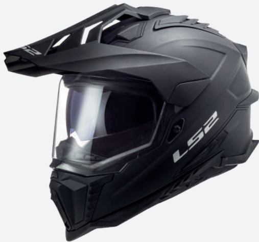
SOLID Matt Black 46701 10 11