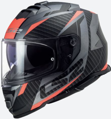
RACER Matt Titanium Orange 10800 21 52