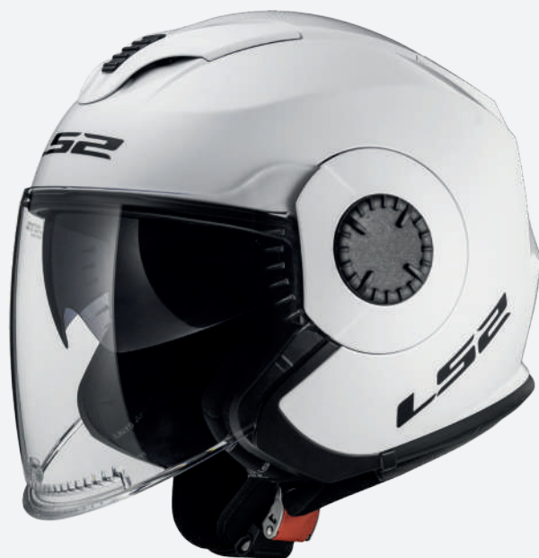
SOLID White 30570 10 02