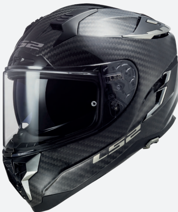
SOLID Carbon 10327 70 99