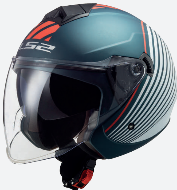
LUNA Matt Blue White 30573 50 25