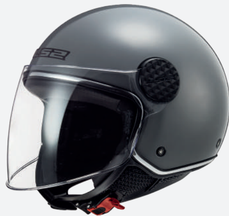
SOLID Nardo Grey 30558 37 04