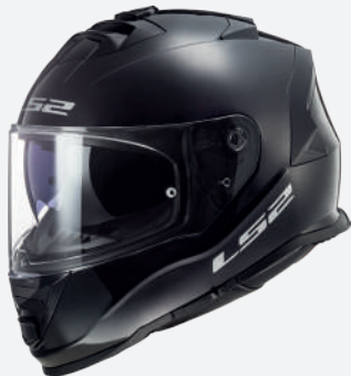
SOLID Black 10800 10 12