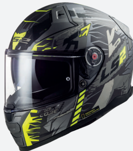
TECHBOT Matt Titanium H-V Yellow 16811 22 53